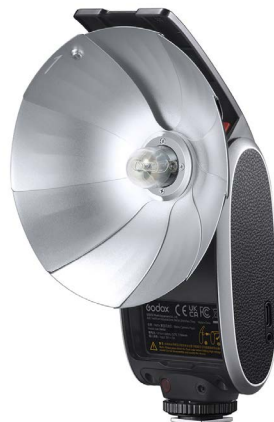
Godox Lux Senior Retro Flash - $169

Happy Holidays to all, and I hope you have a healthy, successful and retro New Year!