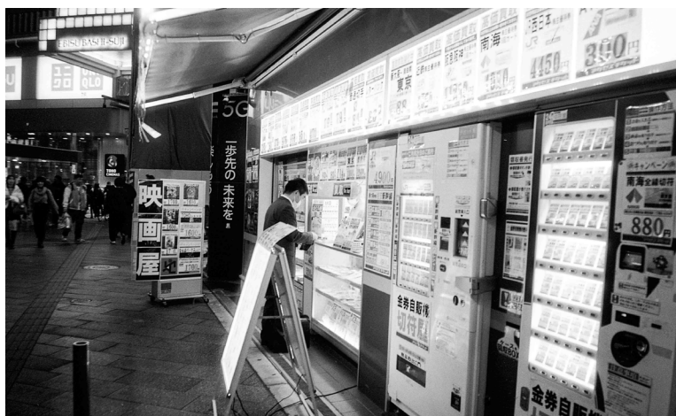
Kentmere 200 with Leica C3