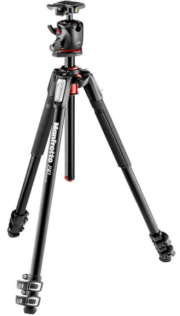
Manfrotto 190 Pro 3 section with MHXPRO-BHQ2 Ball head Sale $387.95 Reg. $499.95