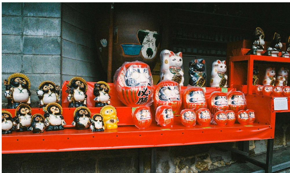
Kodacolor 200 with Leica C3