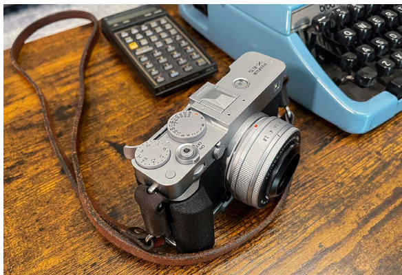
Fujifilm X-E5/ XF23mmF2.8 R WR - $2250

High up on my list - and yes I am biased - are the Fujifilm GFX100RF and X-E5 releases, and to a slightly lesser extent, the XT30 III. The GFX100RF is an amazingly compact 100 megapixel medium format rangefinder styled camera that is truly small enough to be considered an everyday walkaround camera. The GFX100RF is barely larger than an X100VI, although it is missing out on having the Hybrid Optical/EVF viewfinder; it simply has an excellent, high resolution EVF. It also does not have in-body stabilization like the X100VI, since the lens would have needed to be much larger and that would have ruined one of the reasons it even exists.