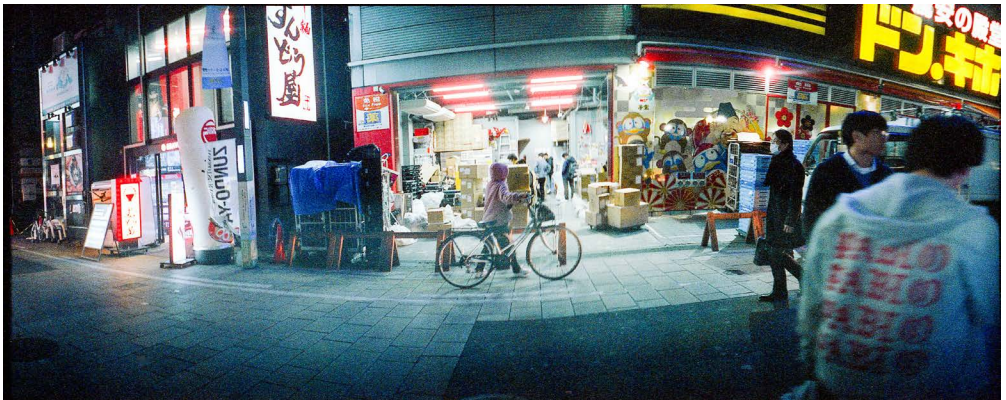
Candido 800 with a Widelux F7 camera

These 3 film stocks are ones I will continue to use in the new year due to overall preference in look and cost. Together, they give you a solid mix of expressive monochrome and easygoing color for nearly any situation.