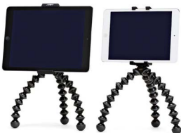
Joby GRIPTIGHT PRO TABLET Sale $49.95 Reg. $79.95