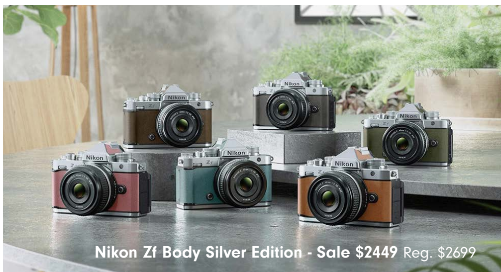
Nikon Zf Body Silver Edition - Sale $2449 Reg. $2699

I am going to selfishly look at 2025 and 2026 through the eyes of someone who is a big fan of retro photography equipment. We had some nice releases from Nikon, including the new silver version of the Zf , which really reminds me of an old FE or FM film camera. They also released the ZR, a heavily video-biased mirrorless camera, but yeah, that one is not at all retro, so for me the silver Zf stood out. They still have the Zfc and the black Zf as well, plus a few SE lenses with old school styling. Additionally, you can special order the Zf in a lovely range of cladding colours, not just boring black, two examples being moss green or cognac brown.