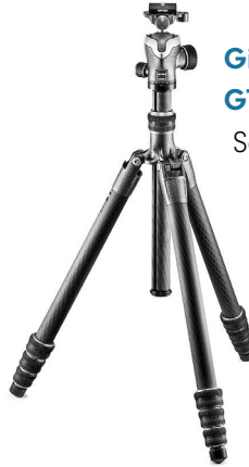
Gitzo Traveler Kit Series 2 GT2545T + GH1382QD Sale $999.95 Reg. $1269.95