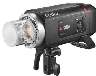
Godox AD400 Pro II Flash - $899

Finally, I want to wish all our customers and their families, the very best for the new year and I hope to help you out with all of your photography needs.