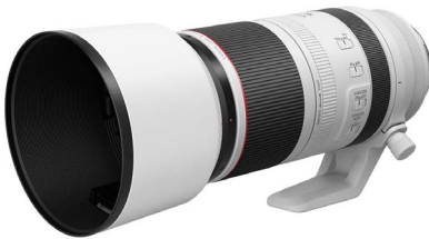
RF 100-500mm f/4.5-7.1L IS - $3,999 (reg. $4,199)