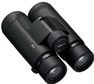
PROSTAFF P7 8x42 - $199 (reg. $249) PROSTAFF P3 8x30 - $119 (reg. $169)