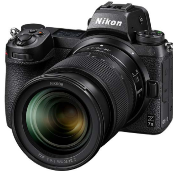
Z7 II Body - $2,699 (reg. $3,499) Z7 II Kit w/24-70mm f/4 S $3,399 (reg. $4,199)