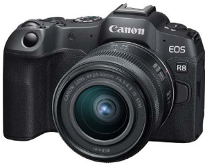
R8 Kit w/24-50mm STM - $2,099 (reg. $2,399)