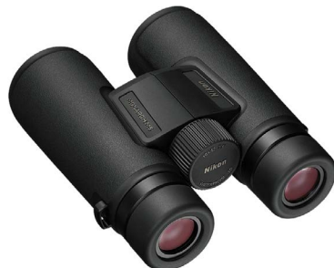
MONARCH M5 10x42 - $379 (reg. $479)