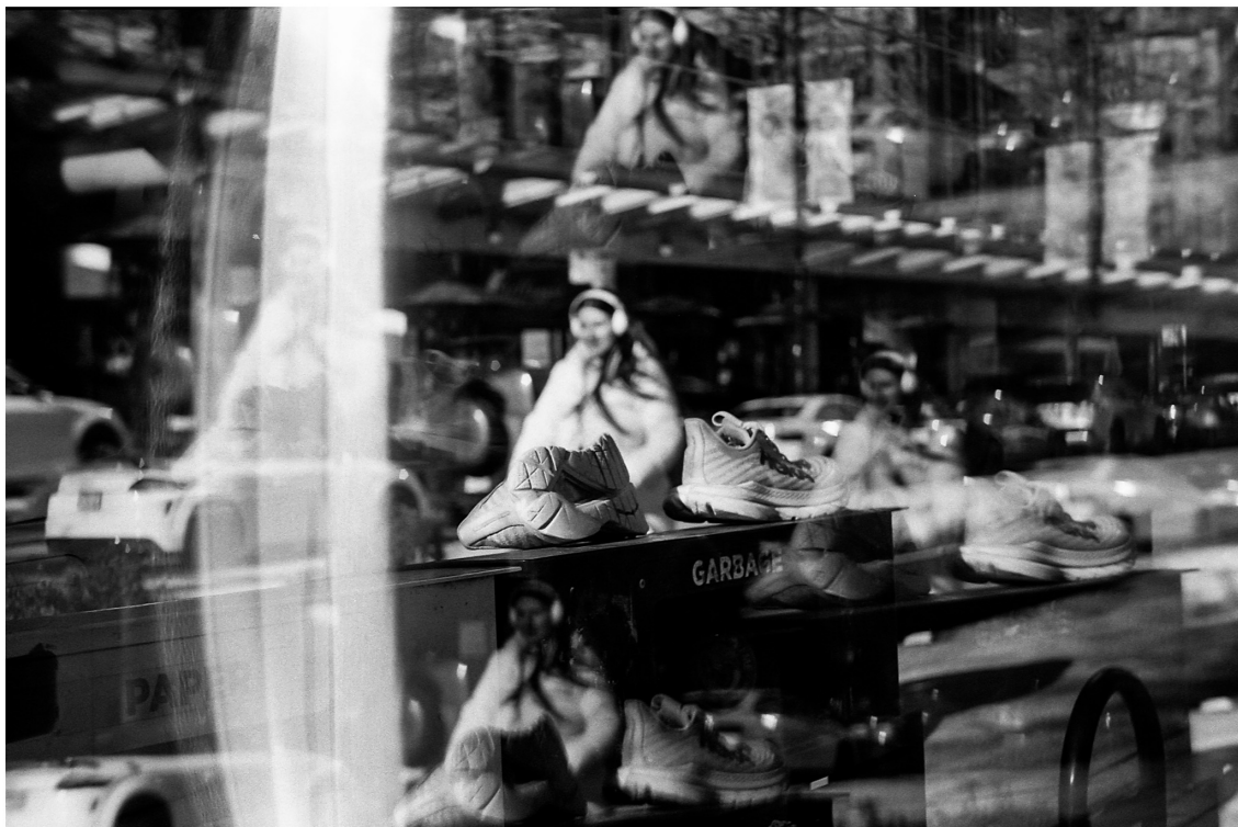
Marley tests the Ultrafine Xtreme UFX 400 film...