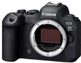
EOS R6 Mark II Body $2,799 (reg. $3,199)