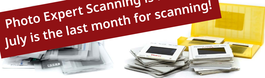
Photo Expert Scanning is retiring. July is the last month for scanning!

Do you have boxes and albums full of old photographs? We now offer a scanning service brought to you by Photo Expert Scanning. This great new service is a low cost approach that delivers quality images suitable for printing up to 12x18 inch sized prints.