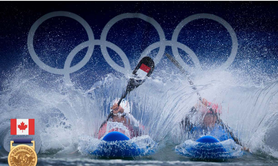
Gold Medal, World Top 10, Best of Nation