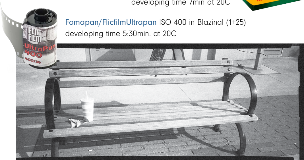
Fomapan/FlicfilmUltraPan ISO 400 in Blazinal (1+25) developing time 5:30min. at 20C