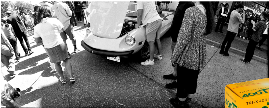
Kodak Tri-X - ISO 400 in Blazinal (1+25) developing time 7min at 20C