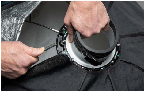
Traditional Profoto speeding. These can be used with most softboxes.

A while back, Profoto started to re-examine what they offered in a traditional style of softbox. Then they introduced the Clic line of softboxes for their A-series flashes, which were a big hit with wedding and location photographers. It was not long before they launched a new, redesigned line of “Profoto Softboxes” with integrated ring for their B and D series of flashes and Pro heads. With the introduction of this