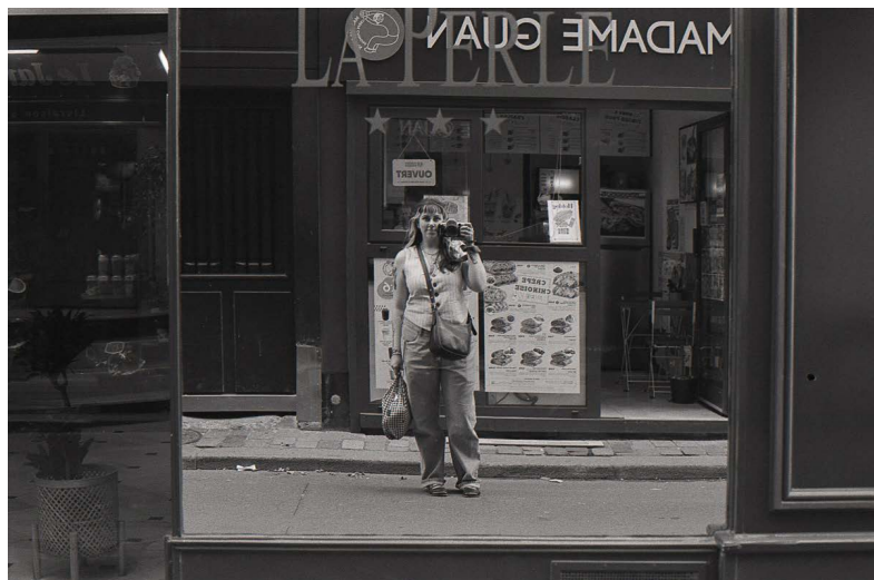
Image with - and of - the Canon Elan IIe on Ilford HP5

Read more on my blog - https://www.beauphoto.com/autofocus-slrs/