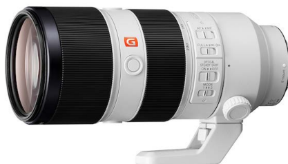
Sony FE 70-200mm f/2.8 G Master - $2,599 (reg. $2,699)