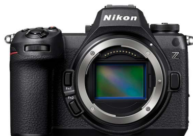
Nikon Z6 III Body - $2,849 (reg. $3,399)

Nikkor Z 800mm f/6.3 VR S - $7,699 (reg. $8,499)