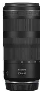
Canon RF 100-400mm f/5.6-8L IS - $879 + $100 Cashback

See our rebate blog posting for all the other Canon rebates, as well as others: https://www.beauphoto.com/ongoing-rebates-canfujinikon/