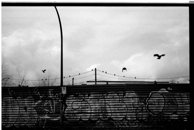
Scenes from East Van. Ilford FP4 developed in Blazinal.