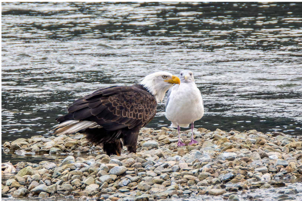
Eagle & Gull

Fuji X-T5 + Fuji XF 500mm f5.6 R LM OIS WR - 1/125 sec, f5.6, 3200 ISO