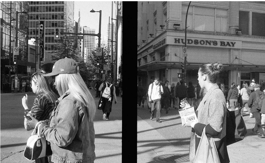
Two frames from the Pentax 17

We have a used one in good condition here at Beau Photo for $650