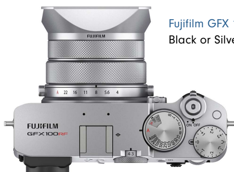
Fujifilm GFX 100RF Black or Silver - $7000