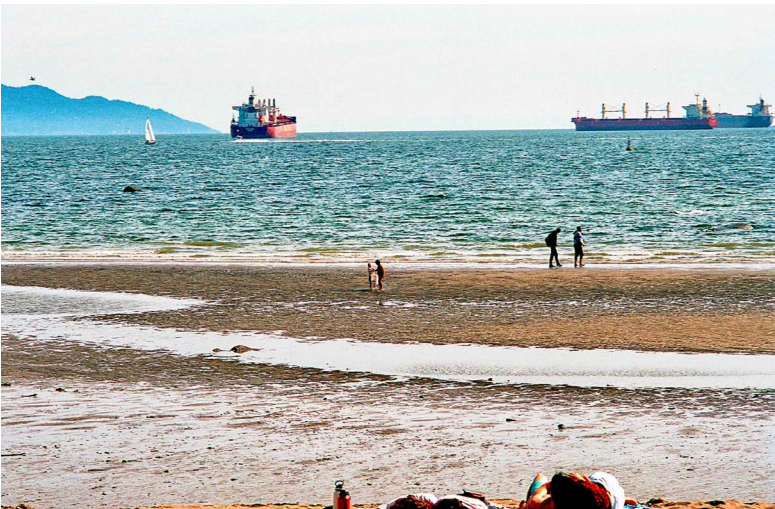
Images taken on a Canon AE-1 with Street Candy Psychedelic Street 400 film