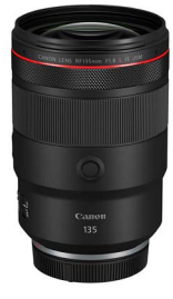
RF 135mm f/1.8L IS - $2,699 (reg. $2,849)