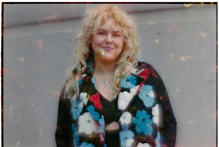
Images taken on a Pentax MX with Revolog Echo film

Revolog Echo 400 135-36 is available for $30.95, as well as two other Revolog films, Kosmos and Kolor .