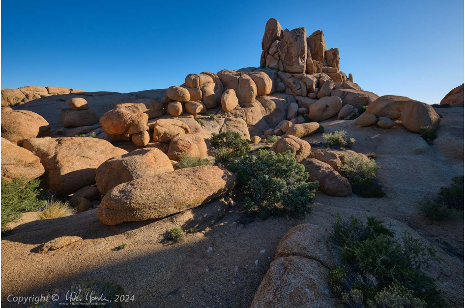
Fujinon XF 8mm f/3.5 R WR – Joshua Tree National Park, CA

For the full article on ultra-wide lenses see my blog here: https://www.beauphoto.com/enjoying-ultra-wide-lenses/