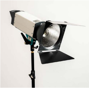
Used Visatec Solo 3200/1600 B - 2 head kit - Sale $450 Reg. $850