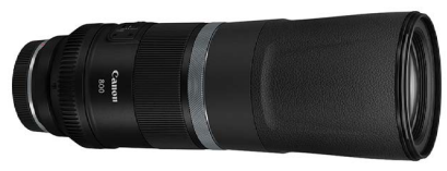
RF 800mm f/11 IS STM - $1,299 (reg. $1,399)