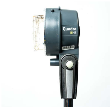
Elinchrom ELB 400 2 head kit with soft- box - Sale $900 Reg. $1200