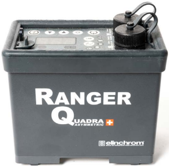
Used Elinchrom Quadra Ranger Kit w/ 2 heads - Sale $650 Reg. $950