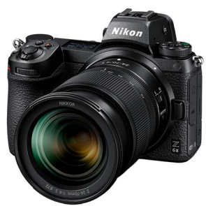
Nikon Z6 II Kit w/24-70 f/4 S - $2,999 (reg. $3,499)