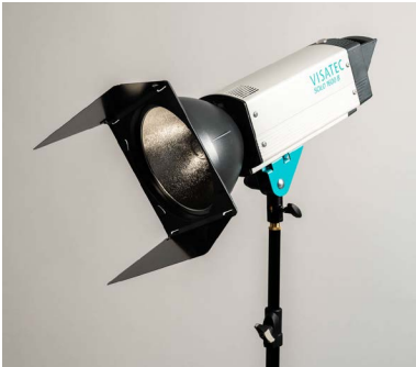
Used Visatec Solo 1600B 3 head kit - Sale $850 Reg. $1500