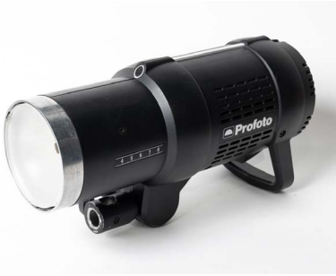
Used Profoto B1 500 Air TTL 2 Head Kit - Sale $2100 Reg. $2400