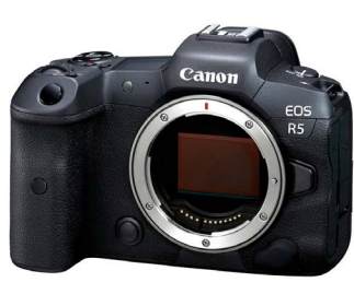
EOS R5 Body - $4,199 (reg. $4,399)