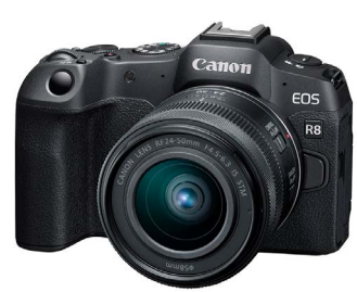
EOS R8 Kit w/24-50mm - $2,149 (reg. $2,299)

Canon has a number of rebates starting on April 4th and running to April 24th with a few key ones following. For the full details, head over to our rebate blog posting here: https://www.beauphoto.com/ongoing-rebates-canfujnikson