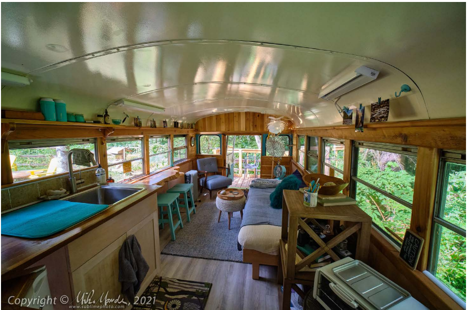
Laowa Zero-D 9mm f/2.8 – School Bus Accommodations – Sayward, BC