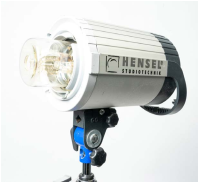
Hensel Integra 2 head kit: Includes small softbox, 3 reflectors and 2-stands - Sale $1200 Reg. $1500

Plus many more in store! Come in soon for the best selection.