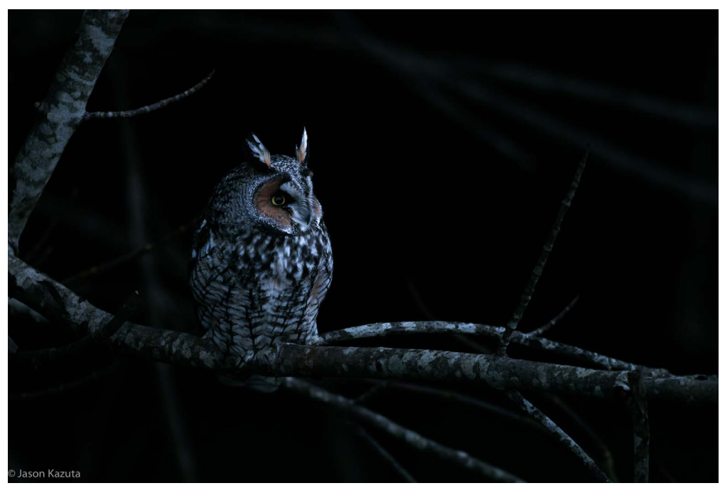
Long Eared Owl Canon R5 + EF 600mm f4L 1/40 sec, f4, 6400 ISO