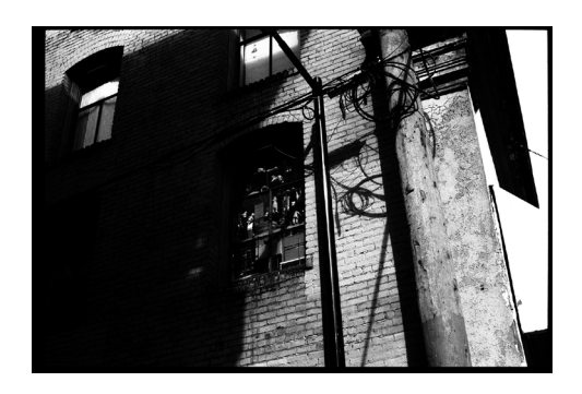
Ferrania P33 - $20.94 per roll plus tax

I can't wait to see how everyone's film turns out with all the different developing, editing and shooting styles that will be used! Come by and tell us your experiences with this film, and show us some images if you have them.