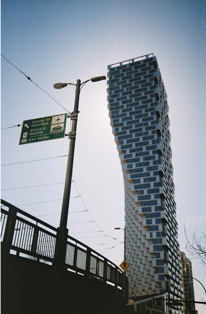
Images on Pro Image 100 in a Minolta Autofocus V point and shoot camera.