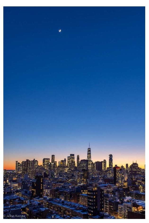
NYC Canon R5 +EF 24-105mm f4L IS 1/30 sec, f4, 1600 ISO

Anna's Hummingbird Canon R5 + EF 600mm f4L 1/5000 sec, f4, 400 ISO