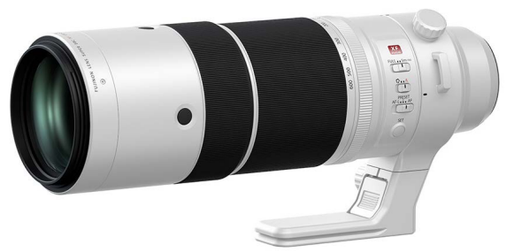
XF 150-600mm f/5.6-8 R LM OIS WR - $2,150 (reg. $2,550)

XF 18mm f/1.4 R LM WR - $1,225 (reg. $1,275) XF 50-140mm f/2.8 R LM OIS WR - $1,900 (reg. $2,160)