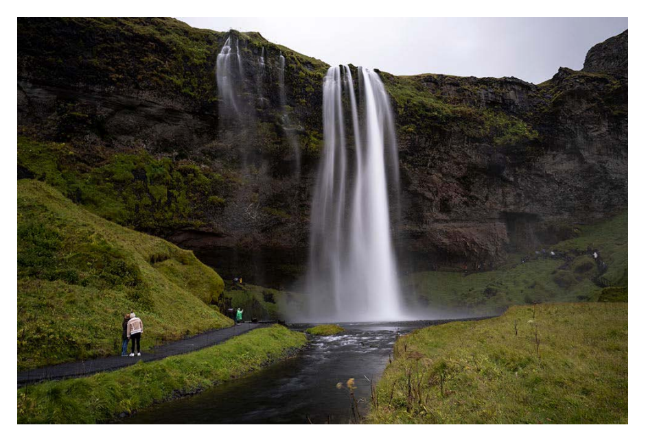
Taken using the Lee Big Stopper

As a follow up to my latest Blog, https://www.beauphoto.com/what-i-learned-about-drop-in-filters-in-iceland/, for the month of April save 10% off all LEE Filters 85 and 100 system kits and items.