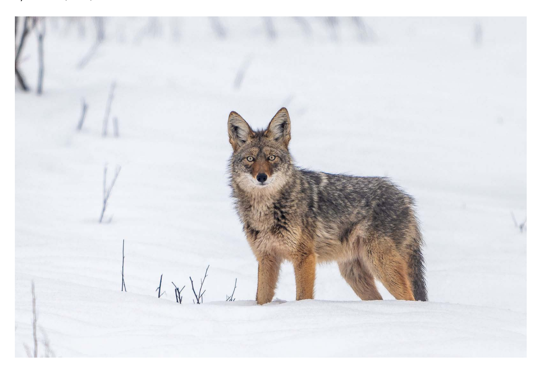
Coyote Nikon Z9 + Z 180-600mm f5.6~f6.3 VR 1/200 sec, f6.3, 64 ISO