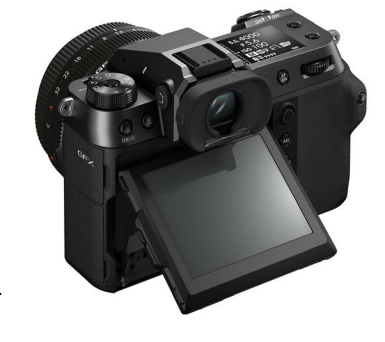
GFX 100S Body - $5,950 (reg. $7,800)

GF 80mm f/1.7 R WR - $2,425 (reg. $2,990)