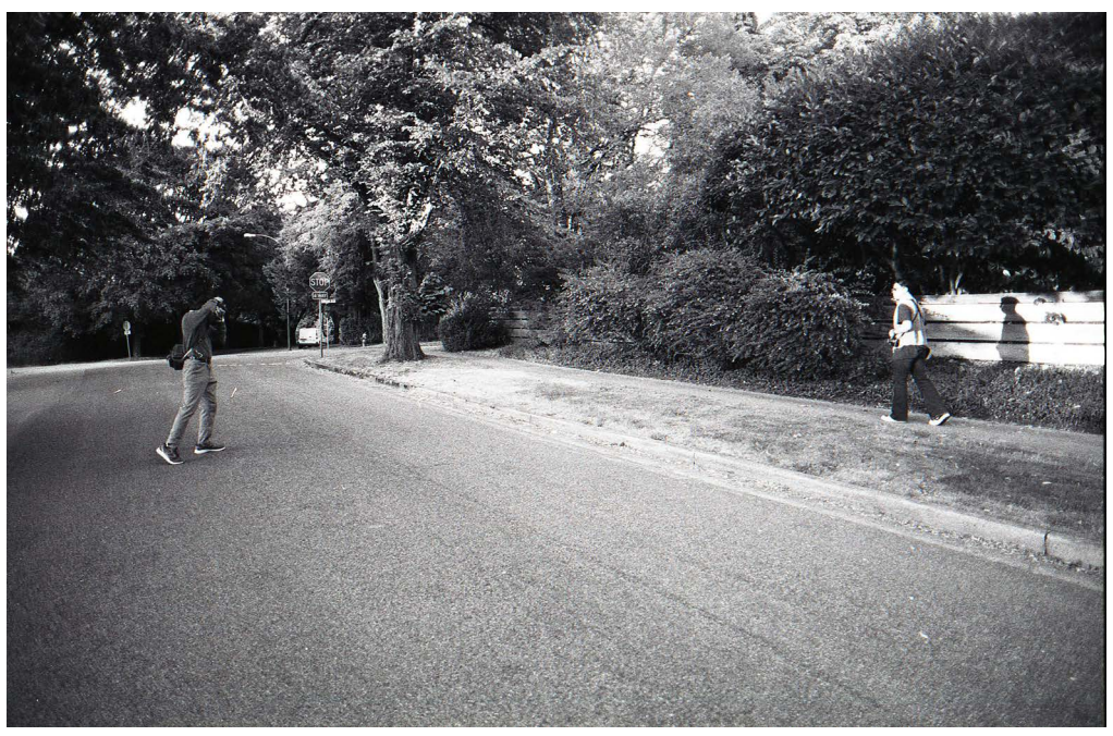
Taken with the Nikon F camera on Kentmere Pan 400 Developed in Ilford DDx