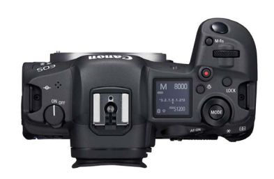
EOS R5 Body - $3,999 (reg. $4,599)

PRO-1000 17" Printer - $1,399 (reg. $1,599)