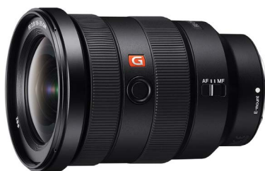
FE 16-35mm f/2.8 G Master - $2,799 (reg. $2,999)