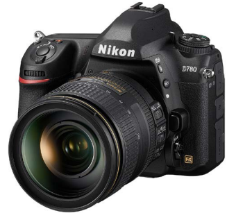
D780 Kit w/24-120mm f/4G VR (open box) - $2,999 (reg. $3,699 - SAVE $700 - one only!)

- Save $499 when bought with Z5 body only