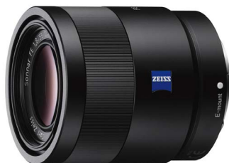
Sony/Zeiss 55mm f/1.8 - $1,149 (reg. $1,249)