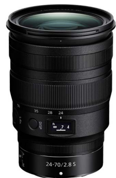
Z 24-70mm f/2.8 S - $3,049 (reg. $3,099)