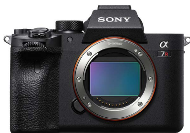
A7R IV Body - $3,999 (reg. $4,199)