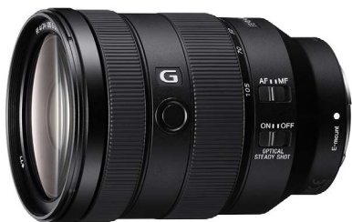
FE 24-105mm f/4 OSS - $1,649 (reg. $1,749)