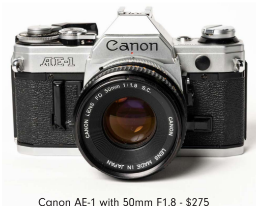
Canon AE-1 with 50mm F1.8 - $275

The Canon AE-1 is a classic 35mm film SLR camera that was introduced in 1976. It quickly became popular due to its innovative features and affordable price, and it remains a favorite among film photographers today.