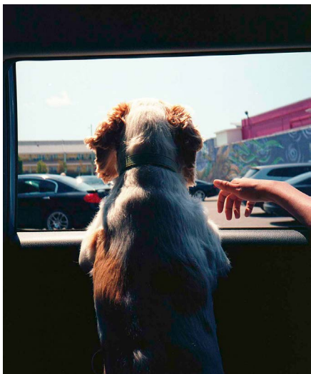
Canon AE-1 w/50mm F1.8 FD lens Ultramax 400 film

One of the standout features of the AE-1 is its shutter-priority automatic exposure mode, which allows the camera to automatically set the shutter speed based on the selected aperture setting. This makes it easy for photographers to quickly adjust the depth of field while maintaining proper exposure.