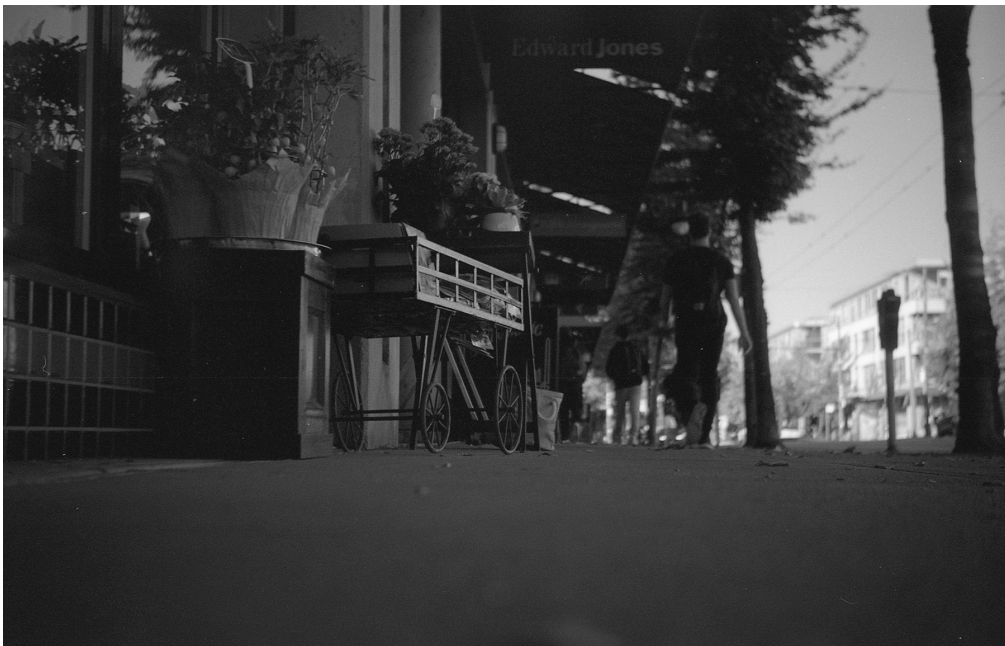
Lion: "I was out on my first photo walk with the Buena and noticed this cool looking metal cart outside a plant shop on Arbutus St."

Did I say fun to use? Heck Yah! Feels good, easy to hold in my hands, bright view finder, settings on top of the shutter easily visible and focus ring has a depth of field scale ;).