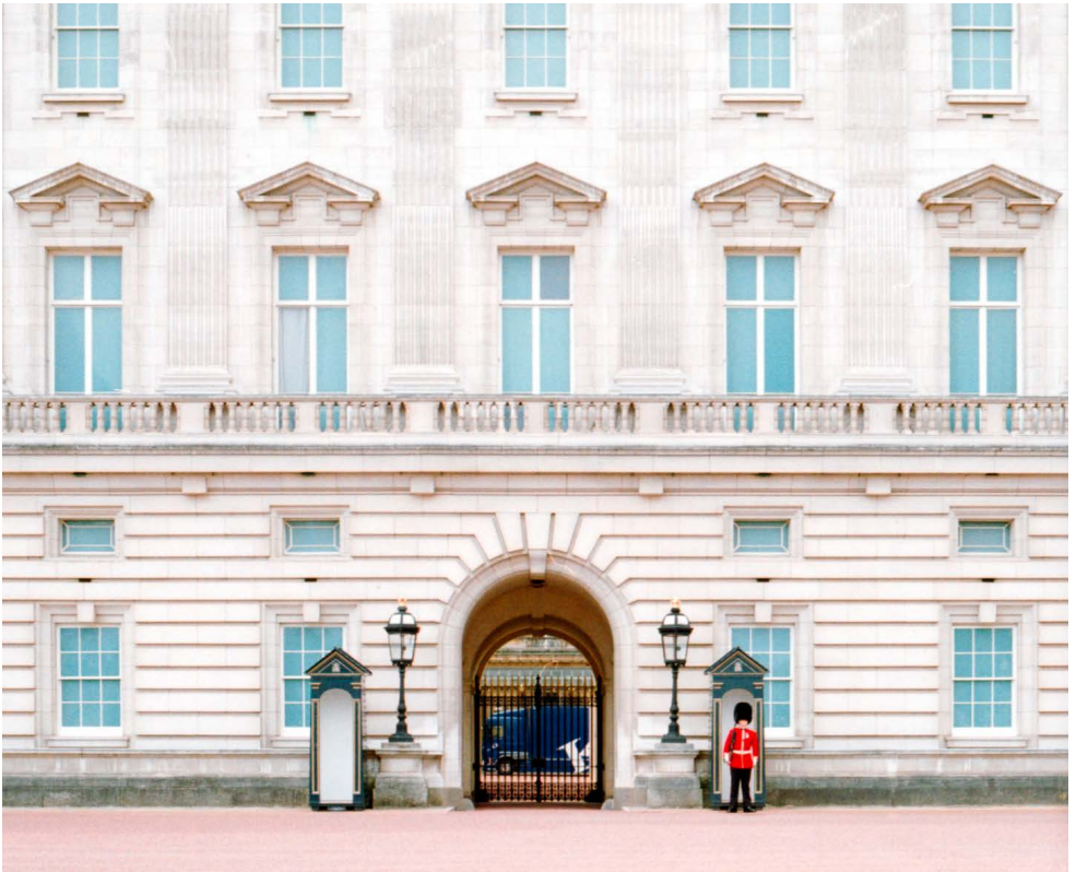
Buckingham Palace, Leica M3 + Zeiss 50mm, Portra 400