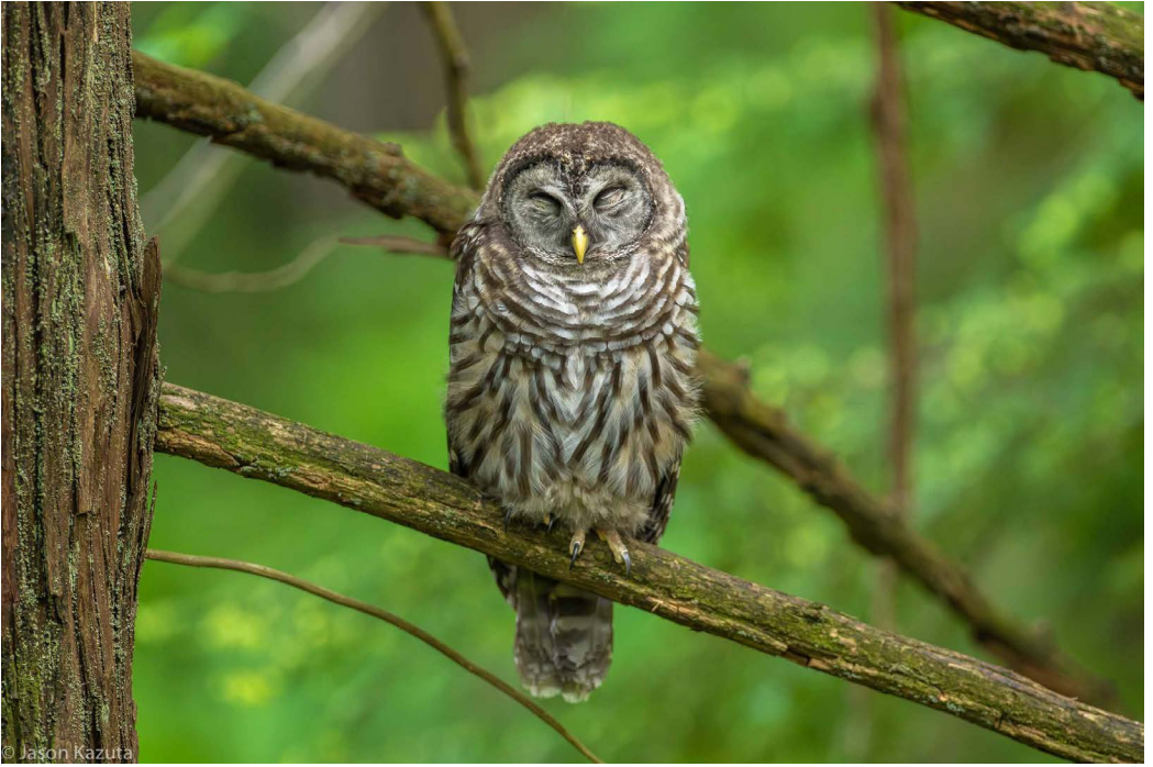
Nikon Z8 + Nikon 300mm f2.8 VR 1/30 sec, f2.8, 1200 ISO