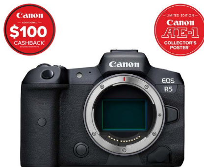
EOS R5 Body - $4,799 CB $100 + 1/2 price LP-E6NH battery (reg. $5,299)

Please note that Fujifilm has also discontinued several other models, including the X-Pro3 and the X-E4, with no direct replacements in sight. However see elsewhere for the new X-S20 introduction, although while an impressive camera, it is distinctly