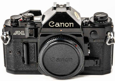
Canon A1 body - $150