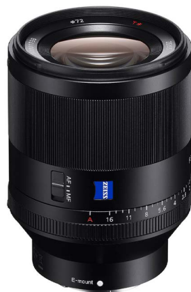
Sony/Zeiss 50mm f/1.4 - $1,349 (PRICE DROP! Was $1,949)