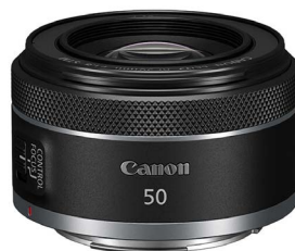
RF 50mm f/1.8 STM - $249 CB $20 (reg. $269)