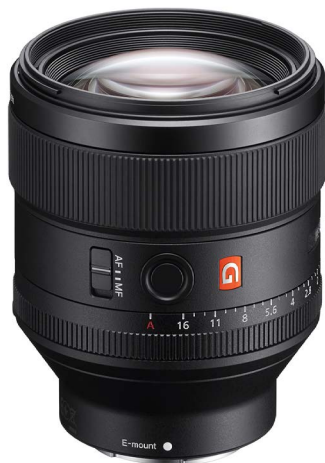
FE 85mm f/1.4 G Master $2,299 (reg. $2,399)