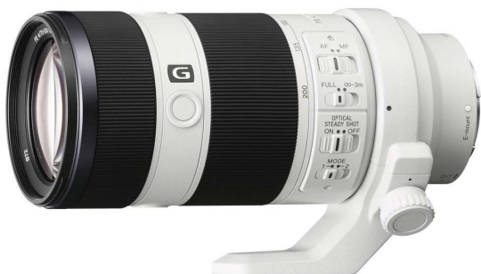
FE 70-200mm f/4 OSS - $1,699 (reg. $1,799)