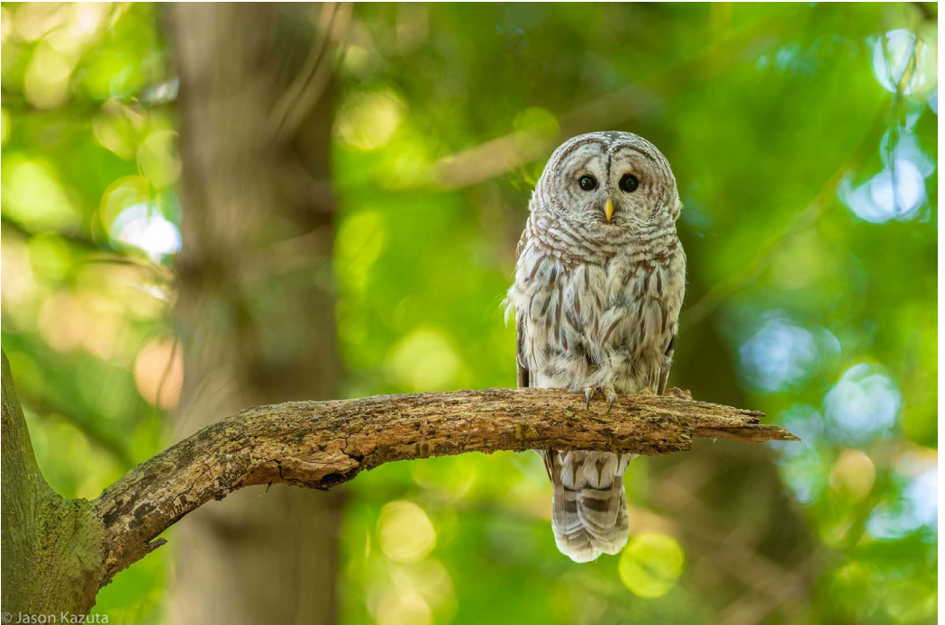
Nikon Z8 + Nikon 300mm f2.8 VR 1//60 sec, f2.8, 1600 ISO