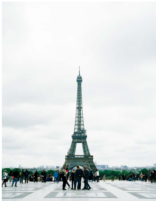
Trocadéro Square, Plaubel Makina 67, Gold 200

Camera wise, I knew I'd be bringing the Leica M3 with a Zeiss 50mm f2, as that camera has become my daily shooter. Since this trip centered around seeing family, I also brought my Nikon 35ti so that I could have something small to keep in my pockets. The decision that sparked the most debate was whether I would be shooting medium format on this trip or not - and if so, which medium format camera to bring. I was debating about bringing my Bronica SQ-A, but after lifting it (and realizing that if I bring it, I would want to bring multiple lenses,) I knew that would be a bad idea due to how heavy the camera is. I ended up bringing my Plaubel Makina 67 for the ease of packing the camera in my bags and for its light weight compared to other medium formats.