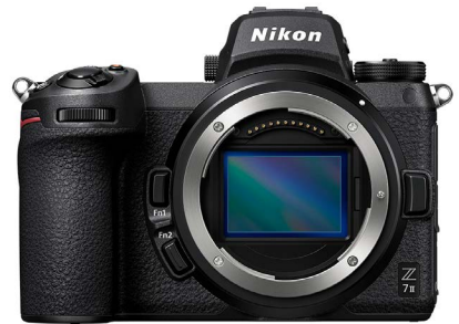
Z7 II Body - $3,499 (reg. $3,999)