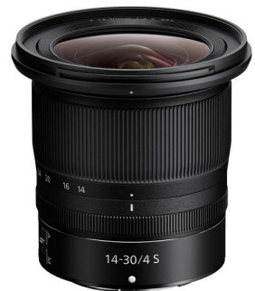
Z 14-30mm f/4 S - $1,499 (reg. $1,729)