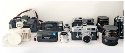
Part of my camera collection