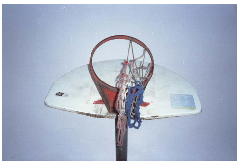
Taken with an Olympus OM-1 on Cinestill 800t