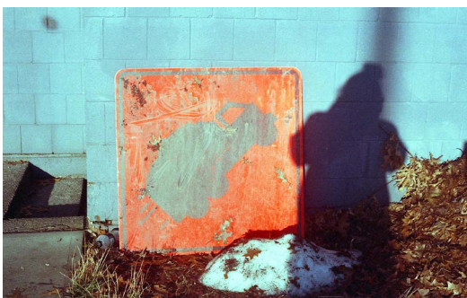
Taken with an Olympus OM-1 on Kodak Ultramax 400

Originally, this camera was named the Olympus M-1. You might remember that Leica has an M1. So when Leica found out about this, they (very politely) asked Olympus to change the name of their camera. Olympus did what was asked of them and changed the name to OM-1. You can still find the original M-1 out there, but they are harder to come by.