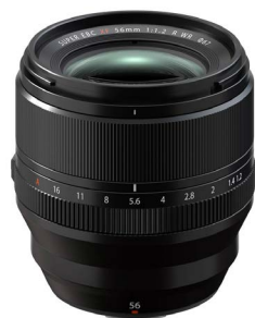
XF 56mm f/1.2 R WR

As far as my personal kit, as much as I still love my Fujifilm X-Pro2 , in the new year I will likely be buying the X-T5 for its 40MP sensor with improved dynamic range, as well as its extremely effective in-body image-stabilization (IBIS). I've recently modified my lens kit, replacing two lenses that I loved (the XF 50mm f/2 R WR and XF 90mm f/2 R LM WR ) with the exceptional new XF 56mm f/1.2 R WR . The new 56mm focuses closer and faster than the old, and has even smoother bokeh. While I do prefer the 90mm focal length for tight headshots, I rarely do those, and I do use my 50mm far more for landscape and cityscape work... so it made sense to replace both with the new 56mm in my kit. Watch for a detailed upcoming review of the new XF 56mm f/1.2 R WR, where I intend to compare it to both of the old 56mm lenses, the regular and APD versions.