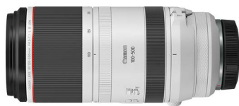
RF 100-500mm f/4.5-7.1L IS - $3,699 (reg. $3,849)