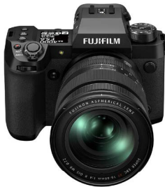
X-H2 Kit w/XF 16-80mm $3,150 (reg. $3,200)

VG-XH2 Vertical Battery Grip - $275 (reg. $515)