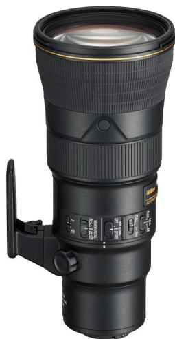
AF-S 500mm f/5.6E PF VR - $4,449 (reg. $4,699)

Z fc Body - $1,199 (reg. $1,299) Z fc Kit w/ Z 28 f/2.8SE - $1,499 (reg. $1,599)