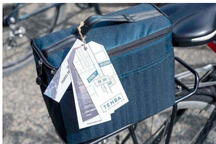
Tenba BYOB 10 bag - $79

https://www.beauphoto.com/product/tenba-byob-10-camera-insert-blue/