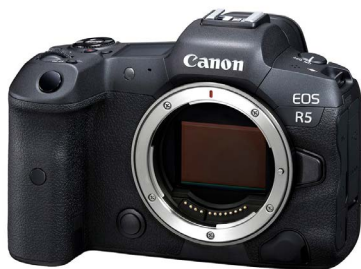
EOS R5 Body - $4,799 (reg. $5,299)

PRO-300 13" Printer - $1,099 (reg. $1,249) PRO-1000 17" Printer - $1,399 (reg. $1,599)