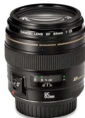
EF 85mm f/1.8 - $599 (reg. $669)

EF 85mm f/1.4L IS - $1,999 (reg. $2,099)