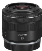
RF 35mm f/1.8 IS Macro $599 (reg. $649)