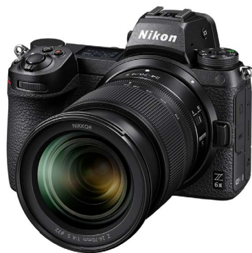
Z6 II Kit w/Z 24-70 f/4 VR $3,199 (reg. $3,499)

Nikkor Z 24-120mm f/4S - $1,299 (reg. $1,499) - Save $200 when bought with any full-frame Z-series body