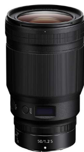
Z 50mm f/1.2 S - $2,599 (reg. $2,799)