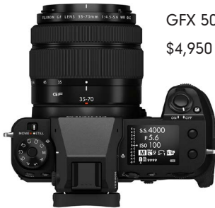
GFX 50S II Kit w/GF 35-70mm $4,950 (reg. $5,625)

Fujifilm has a number of rebates this month which started in late July and will continue all of August and into September . If you've been holding off on a battery grip or file transmitter grip for the X-H2 or X-H2S, then now is the time to act... check out those discounts!