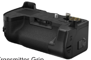
VFT-XH2 File Transmitter Grip $800 (reg. $1,280)

XF 2.0x Teleconverter - $475 (reg. $600)