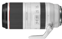
Canon RF 100-500mm f/4.5-7.1L IS - $3,849

Sony FE 100-400mm f/4.5-5.6 GM OSS - $3,399