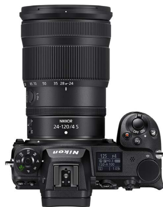
Nikkor Z 24-120mm f/4S

As far as rebates for Sony bodies and lenses go, there is not much to report at the moment. Still only a handful of rebates on some APS-C stuff, and some much older A7 series models.