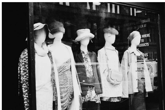
Kodak 400TX Single-Use Camera