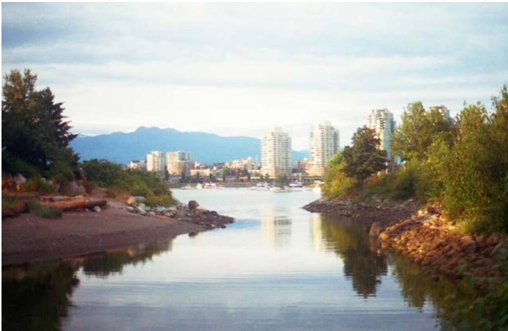
Ilford Ilfocolor Rapid Retro Camera