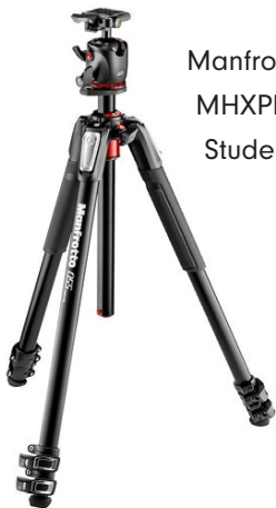
Manfrotto 055 Pro 3 section with MHXPRO-BHQ2 Ball head - Student Sale $499.95 Reg. $573.95