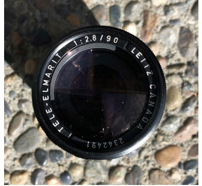
Leica Canada Tele-Elmarit 90mm f2.8 (the smallest of the 90mm) - $1000.00