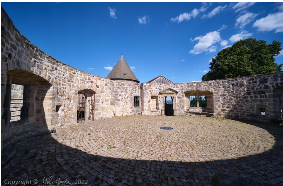
Fujifilm X-T4 with Laowa Zero-D 9mm f/2.8 lens

I had previously done some side-by-side dynamic range comparisons, where I didn't see any obvious, real improvements for the X-T4 over my X-Pro2. However, after looking through a number of challenging shots from this trip, my gut feeling is that the newer 26MP sensor with its base ISO of 160 is indeed slightly better than the older 24MP sensor in the X-Pro2, which has a base ISO of 200. Not a huge