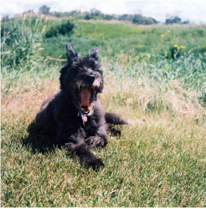
Rolleicord III with Kodak Ektar 100 film

I also shot my Rolleicord III, which is always a favourite of mine to take to the farm. I put Ektar 100 in it this time around, which has a great punch of color and nice sharpness.