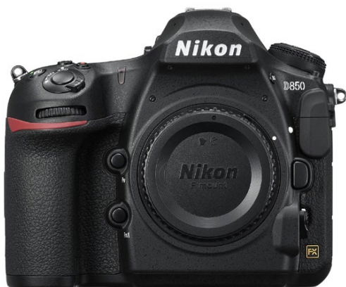
Nikon D850 Body - $3,299 (reg. $3,899)

These Nikon rebates are running from August 19th to September 8th, 2022 as follows... (and check out the great D850 price, and some amazing AF-S lens deals!)