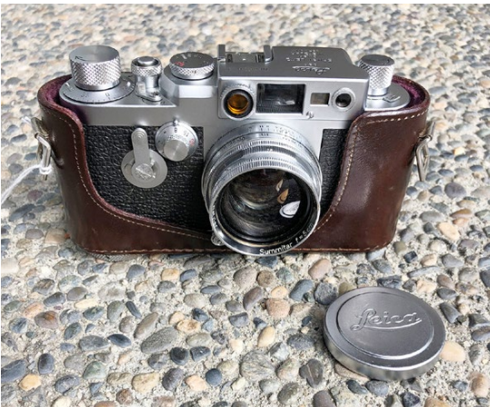
Leica IIIg w/ Summitar 5cm f2 (the last of the Barnacks!) $1500.00