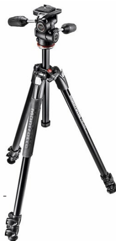
Manfrotto 290 Xtra tripod with 804RC2 3 way head - Student Sale $219.95 Reg. $273.95

Manfrotto 055XPRO3 3 section tripod - Student Sale $306.95 Reg. $364.95