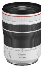
RF 70-200mm f/4L IS $2,199 (reg. $2,399)

RF 800mm f/11 IS STM - $1,099 (reg. $1,399)