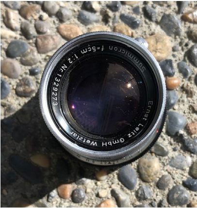
Leica Summicron 5cm f2 collapsible $1000.00