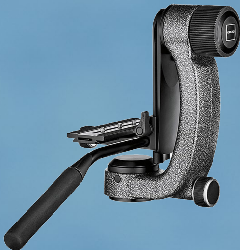
Gitzo GHFG1 Fluid Gimbal Head - $919.95