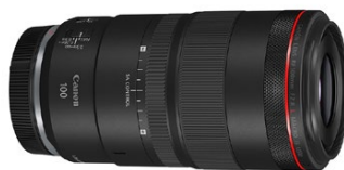
RF 100mm f/2.8L IS macro $1,599 (reg. $1,849)