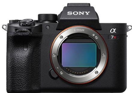
Sony A7R IV Body - $3,999 (reg. $4,499)