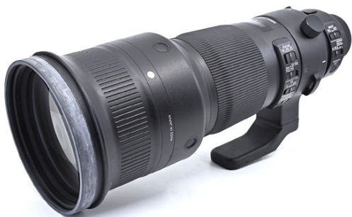
Used Sigma 500mm f4 DG OS HSM | S Nikon Mount - $5500.00

Since summer has decided that it might just stick around for a while, I thought I would mention the great selection of used telephoto lenses we have in the store at the moment. If you have a desire to photograph wildlife, especially with all the migratory birds passing through BC, or want to photograph bigger creatures at a safe distance, and you are not satisfied with the lenses you own at the moment, you might want to purchase a used long lens. Purchasing a used lens is a great way to save money and make your dollar go further. All of our used items come with a 30-day warranty in case there is something wrong with the lens. Selection can change daily so it is best to call to see if that lens you wanted is still here.