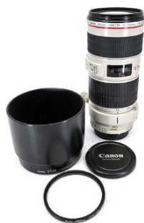
Canon EF 70-200mm f/4L IS USM - $950.00 Condition Very Good

Canon EF 70-200mm f/2.8L IS USM - $1500.00 Condition Very good