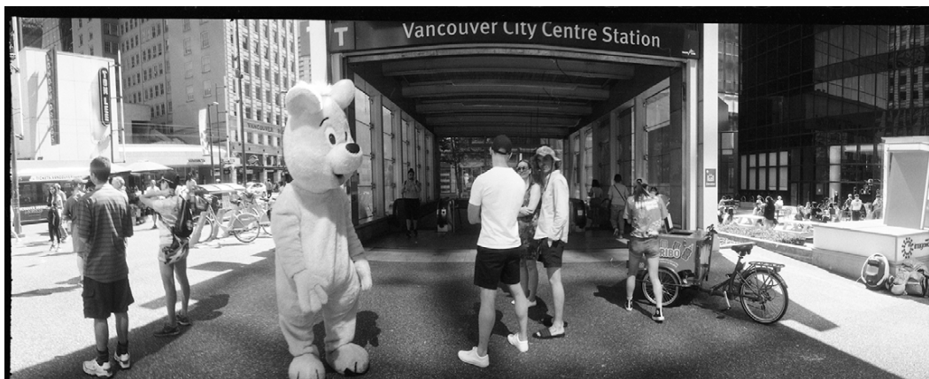
©Mustafa S. Flic Wolfen 100 film in a Widelux F7 Developed in D96

"I liked how punchy it is, with good contrast and detail. Its not too grey like some black and white films, but its not too heavy with the contrast to the point where there is little detail. I would certainly shoot it again at some point! "