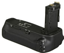
Canon BG-E13 Battery Grip (for EOS-6D) - $225 (was $329)

It's time to move out some slow moving stock, so in our store we've put together a whole showcase section dedicated to clearance items. DSLR accessories like battery grips for older model cameras, grid focusing screens, flash accessories, lens hoods, chargers and more. We also have a bunch of mirrorless accessories like metal hand-grips, vertical grips, chargers, as well as some audio gear such as on-camera mics, and all are discounted! Included are a small number of open-box items, and there are even some new-stock older lenses and bodies on sale! Drop by our store to see all the deals!