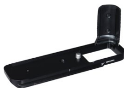
Fujifilm X-Pro1 Metal Hand-Grip - $69.95 (was $144.95)