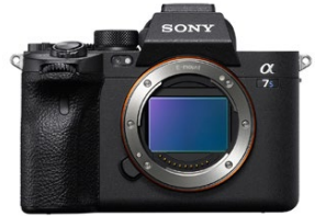
Sony A7S III Body - $4,299 (reg. $4,799)

FE 35mm f/1.4 G Master - $1,799 (reg. $1,899)