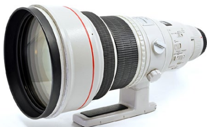
USED Canon EF 400mm f2.8L USM - $4500.00 Comes with Hood, Front & Back Cap, Case * Please note this is the original Canon EF 400mm f2.8L USM lens without image stabilization.

Comes with Bonus Accessories: Sigma 1.4x Teleconverter TC-1401, Sigma USB Dock, Sigma WR Circular Polarizer Filter 46mm w/Holder.