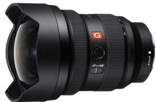
FE 12-24mm f/2.8 G Master $3,899 (reg. $3,999)

Don't forget about our try before you buy program! Try something out that is available in our rental department before you decide to buy. If you love it and decide to buy one within 30 days, you can receive up to two days off of the rental cost as a credit toward the purchase. Ask us for more details and if restrictions apply.