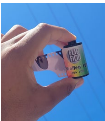
Flic Wolfen 100 - $12.78

I recently shot the Flic Wolfen film and was extremely pleased at the results. Wolfen film is Orwo UN54 re-spooled. Throughout my entire roll I found that it has great tonal range while retaining contrast, no matter my lighting. I shot everything from early morning, bright sunlight to evening shade. I had my friend develop my roll, she is a master developer! She used a Blazinal semi stand develop: 1+100 dilution for 80 minutes. While agitating for five seconds once a minute for the first five minutes and then ten seconds at the 40 minute mark!