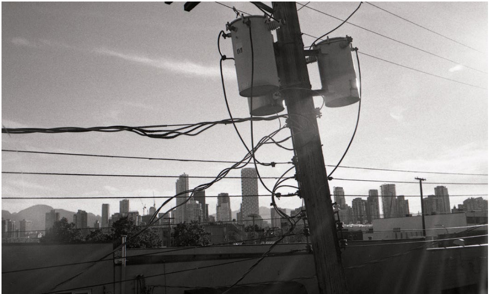
© Nicole LD - Flic Wolfen 100 film in a Leica CL (film) camera

I recently shot the Flic Wolfen film and was extremely pleased at the results. Wolfen film is Orwo UN54 re-spooled. Throughout my entire roll I found that it has great tonal range while retaining contrast, no matter my lighting. I shot everything from early morning, bright sunlight to evening shade. I had my friend develop my roll, she is a master developer! She used a Blazinal semi stand develop: 1+100 dilution for 80 minutes. While agitating for five seconds once a minute for the first five minutes and then ten seconds at the 40 minute mark!