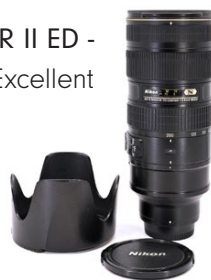
Nikon AF-S 70-200mm f/2.8 G VR II ED - $1100.00 Condition Excellent

Not ready to purchase a long lens? We have a great selection of telephoto lenses for Canon, Nikon, Fujifilm and Sony in our rental department. A full list with rental prices is available here: https://www.beauphoto.com/rentals/rental-cameras/