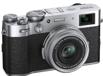
Fujifilm X100V - pre-order items that are in low supply to make sure you get them in time!

Many products continue to be hard to come by and we have waiting lists for a number of items. Things like the Canon RF 28-70mm f/2L, Nikon Z9, Nikkor Z 800mm f/6.3, the new Fujifilm X-H2S, the Fujifilm X100V, Fujifilm X-E4 & X-S10 bodies, Fujinon XF 150-600mm, as well as the Sony FE 24-70 and 70-200mm G Master II lenses... all of those are very slow to ship with frequent customer orders or inquiries. For some bodies and lenses, manufacturers are simply not shipping any to