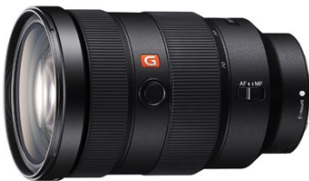
FE 24-70mm f/2.8 G Master $2,699 (reg. $2,899)