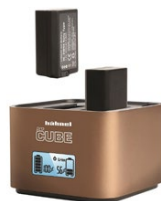
Hahnel ProCube (Sony) Charger - $89.95 (was $119.95)