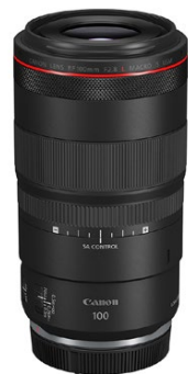
RF 100mm f/2.8L IS Macro $1,749 (reg. $1,849)

EF 100mm f/2.8L IS Macro - $1,599 (reg. $1,699)