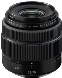
GF 35-70mm f/4.5-5.6 WR