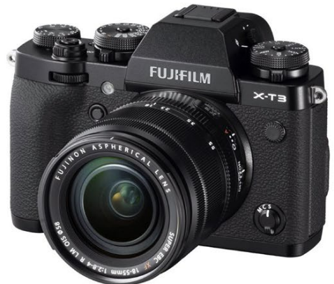
X-T3 (USB Charging)

Pre-order Fujifilm's latest products from Beau Photo today!