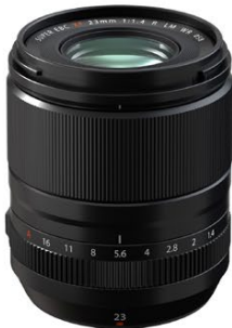
XF 23mm f/1.4 R LM WR