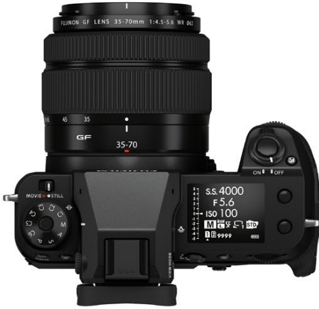
GFX 50S II