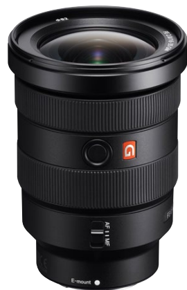
Sony FE 16-35mm f/2.8 G Master $2,799 (reg. $2,999)

Sony FE 90mm f/2.8 Macro - $1,449 (reg. $1,499)