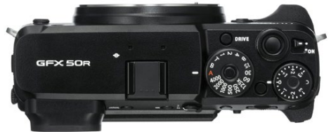
GFX 50R Body - $4,550 (reg. $5,700)