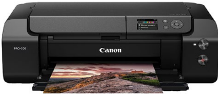
Canon Pro-300 13x19 Printer - $1,149 (reg. $1,249)

* the free filters are normally valued at $900