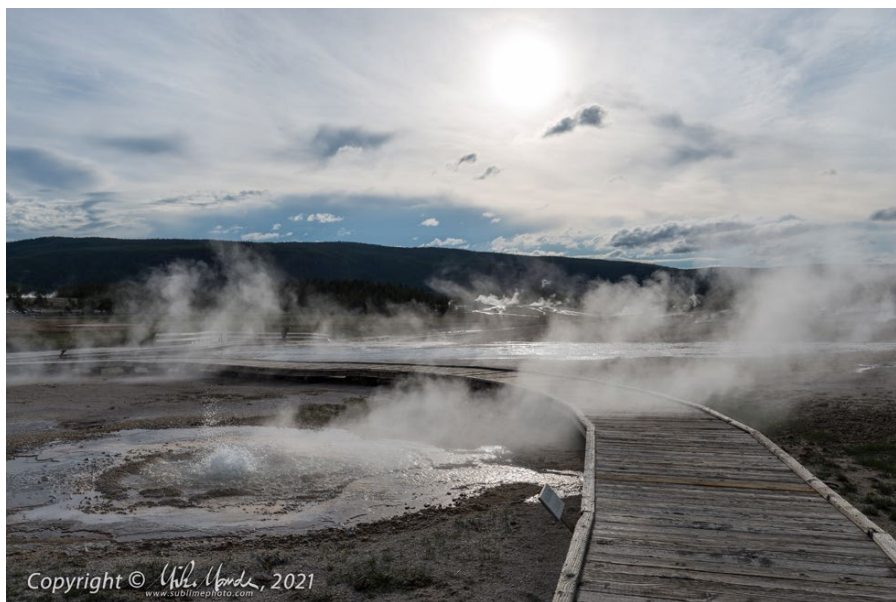
Shooting into the sun with the Nikon 18-35mm lens at Yellowstone National Park

bright light sources doesn't have that nice, pleasing spiked shape. For sun-stars, the AF-S 24mm f/1.4G I had was far superior. A year or two after buying the 18-35mm, when the new AF-S 20mm f/1.8G came out, I compared it to the zoom, and once again, the 18-35mm held its own as far as sharpness and overall image quality, but the 20mm did beat it for sun-stars. It is not really uncommon for prime lenses to have more pleasing sun-stars than zooms. I was a bit surprised that the new prime wasn't really any sharper than the zoom in its overlapping aperture range though!