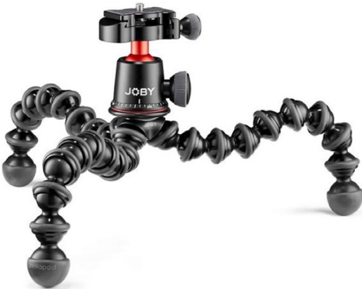
Joby Gorillapod 3K Pro kit Sale $139.95 Reg. 179.95