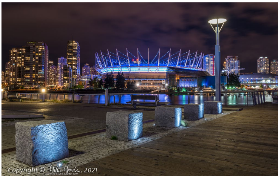
Olympic Village with D800 and Nikkor AF-S 18-35mm f/3.5-4.5G

This is the story of an unsung wide-angle hero, the Nikkor AF-S 18-35mm f/3.5-4.5G ED zoom . A number of years ago, when I was still using a Nikon DSLR system with their excellent full-frame D800 camera, truly groundbreaking in its day for having high resolution (36 MP) as well as pretty much the best dynamic range of any camera at the time, I was hunting for the best ultra-wide lens I could find. I had tested the AF-S 14-24mm f/2.8G and while it was quite good, it suffered from a fair bit of lens flare due to its huge, domed front element, and despite the size of its optics, and substantial weight, it didn't have tack sharp corners at some focal lengths, even when stopped down to f/8 plus. I decided on the AF-S VR 16-35mm f/4G as a lower cost, lighter weight alternative. It could also take filters, which the 14-24mm really couldn't. I used that 16-35mm for a year or so and while it was decent, and the VR was occasionally useful, it was a bit weak at either end of its range, so I always tried to use it as though it were an 18-28mm zoom. I did have the truly superb AF-S 24mm f/1.4G for those times when I didn't need ultra-wide and wanted the very best image quality, and an AF-S 35mm f/1.4G covered me at the other end of that range.