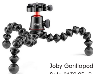
Joby Gorillapod 3K Pro kit Sale $139.95 Reg. 179.95

The Joby Gorillapod lets you securely put your camera anywhere, and is small enough to fit in your bag.