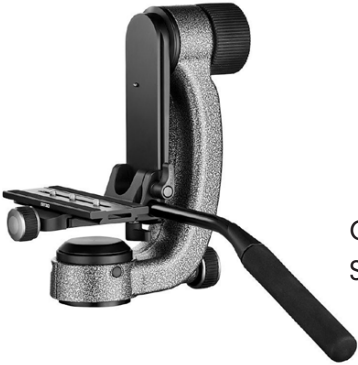
Gitzo GHFG1 Fluid Gimbal Head Sale $719.95 Reg. $789.95