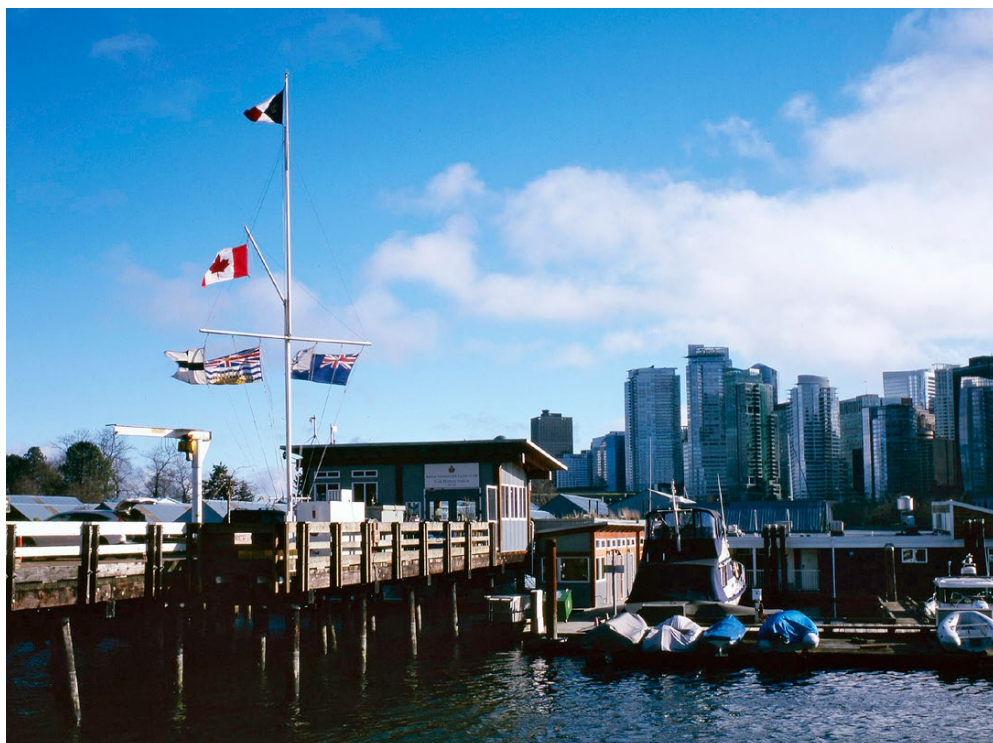
FujiChrome MS 100/1000 film - Mamiya C330 camera