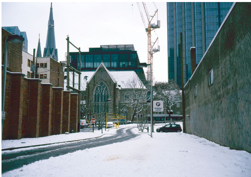
FujiChrome MS 100/1000 film - Fujifilm GW 690 III camera