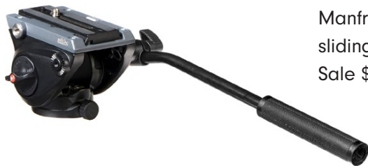
Manfrotto MVH500AH MF 500 head with sliding plate & flat base - Sale $179.95 Reg. $203.95

Manfrotto MVK500XV MF 190X3 Tripod with MVH500AH Video head and leveling base - Sale $419.95 Reg. $489.95