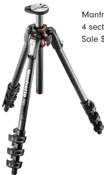
Manfrotto 055CXPRO4 4 section carbon fibre tripod - Sale $499.95 Reg. $650