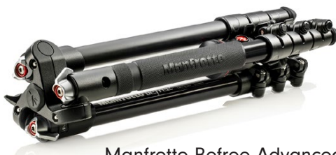
Manfrotto Befree Advanced Aluminum 4 section tripod - Sale $245.95 Reg. $279

Manfrotto 055 Pro 3 section with MHXPRO-BHQ2 ball head - Sale $419.95 Reg. $480