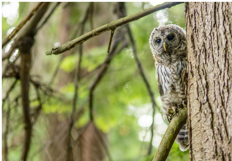
Barred Owl Nikon Z7II Nikon Nikkor Z 50mm f1.2 S 1/60 sec, f1.2, 200 ISO