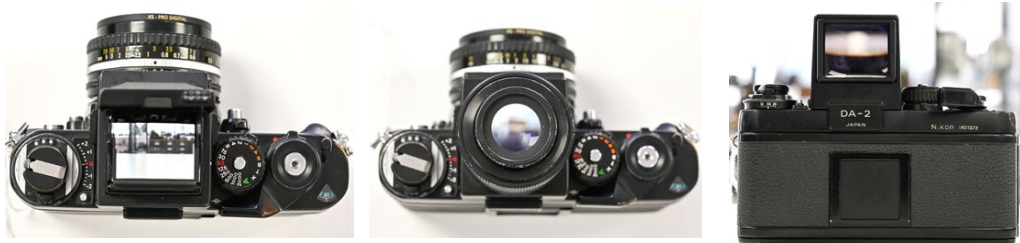
Waist level finder, high magnification finder and the action finder

high magnification finder and then action finder for viewing the images through goggles, helmets and camera housings.