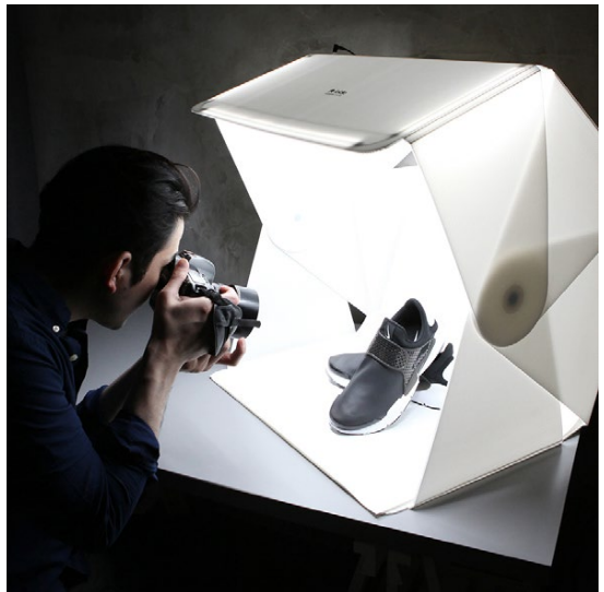
Orangemonkie Foldio 3 Plus All-In-One Portable Studio - Sale $199.95 Reg. 219.95

Orangemonkie Foldio 360 Smart Turntable - Sale 199.95 Reg. 219.95