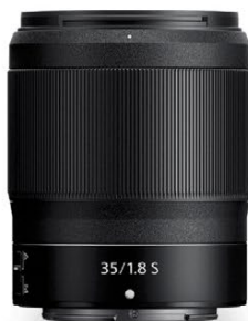
NIKKOR Z 35mm f/1.8 S

Bright, sharp wide angle prime lens with captivating resolution and bokeh.