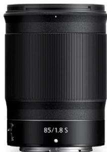
NIKKOR Z 85mm f/1.8 S

Iconic fast prime with new levels of sharpness and depth-of-field control.