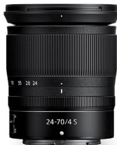
NIKKOR Z 24-70mm f/4 S

Compact ultra-wide zoom for scenic photography with frame-filling sharpness.