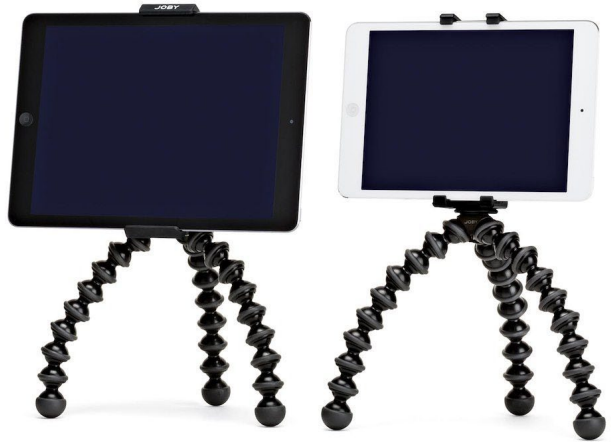
Joby GripTight Pro Tablet Sale $44.95 Reg. $59.95

Joby GripTight Pro Tablet - Sale $44.95 Reg. $59.95