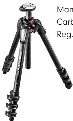
Manfrotto 055CXPRO4 4 section Carbon fibre tripod - Sale $449.95 Reg. $650.95

Manfrotto 290XTA3 with 496RC2 Ball head - Sale $219.95 Reg. $231.95