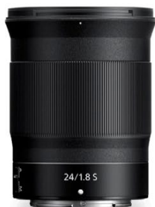
NIKKOR Z 24mm f/1.8 S