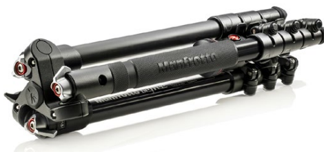
Manfrotto Befree Advanced Aluminum tripod 4 section tripod - Sale $245.95 Reg. $279.95