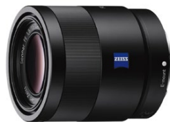
Sony/Zeiss 55mm f/1.8 $1,149 (reg. $1,249)

Don't forget to check the blog for the full list of rebates -