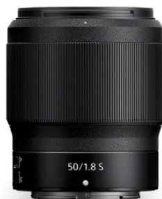
NIKKOR Z 50mm f/1.8 S

Fast wide-angle prime with a classic angle of view, reinvented for the Z Mount system.