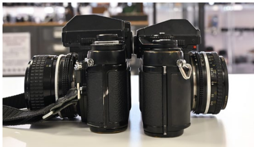
Nikon F3 HP vs F3

It's still very much a system camera, with interchangeable prism finders and focusing screens with attachments like motor drives, data backs and a hot shoe.