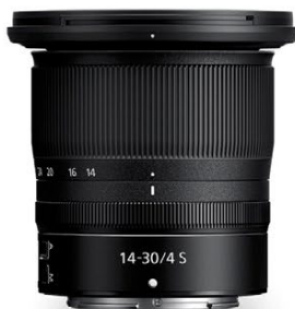
NIKKOR Z 14-30mm f/4 S

Flattering portrait lens with breathtaking resolution and stunning bokeh.