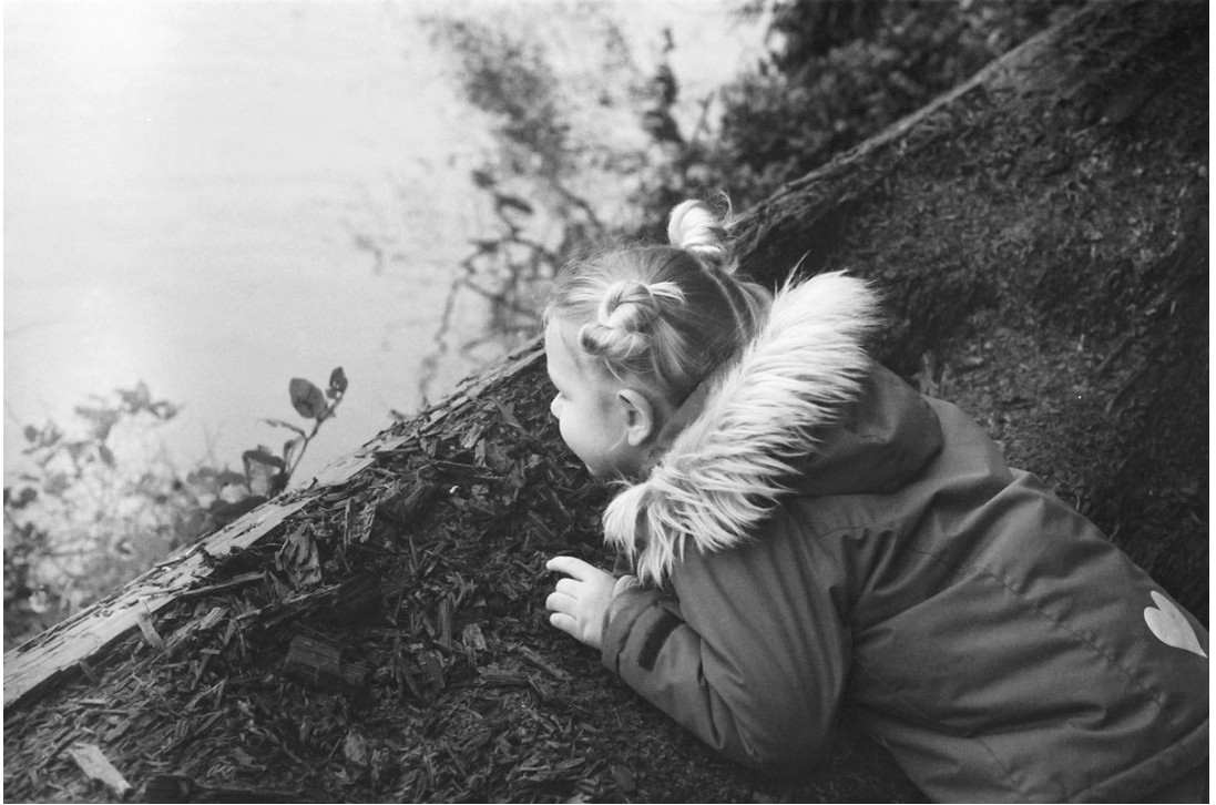
Image ©Meghan S. Nikon EM camera, 50mm 1.8 lens, New Rollei Paul & Reinhold film.