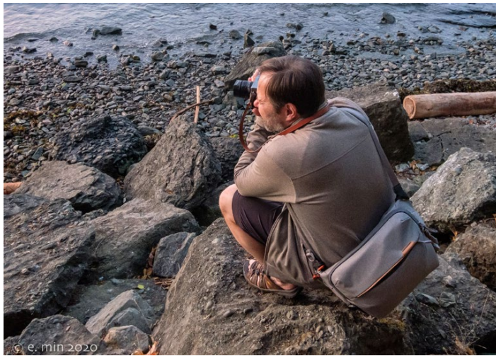
The Peak Everyday Sling 10L vll in action!

size, right? The “perfect” camera bag is a never-ending quest after all! The Peak Everyday Sling 10L vll was one of the smoothest camera bags I’ve ever worked out of, so it definitely comes very highly recommended if you are using a compact mirrorless system and a bunch of small primes! The Everyday Sling also comes in smaller 6L and 3L sizes, if you have fewer lenses or an even more compact kit. We have all three sizes in stock at Beau!