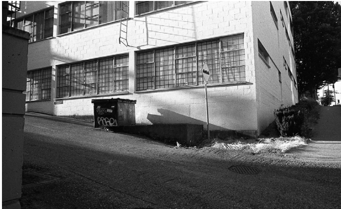
Leica M3 w/ Elmarit-M 28mm f2.8 lens

shopping and social life, there's really been nothing left to do but wander around and shoot, shoot, shoot. I decided I needed to cut costs which brought my attention back to HP5. After developing and scanning a few rolls I found it far more palatable. I have a few hunches as to why - perhaps my skill has increased exponentially (I'd like to think so, since I've been at it for decades now) or it's simply I'm no longer developing my film in Ilfosol S (now known as Ilfosol 3) and I do my own scanning on an Epson V850. I develop all my film in Blazinal (Rodinal), and stand develop for most rolls. Both these factors bumped up the contrast enough for my tastes and I found myself enjoying shooting HP5 again. Here are a few of my latest shots. I used a Nikon FM2n w/ Series E 50mm f1.8 and my Leica M3 w/ 28mm f2.8.