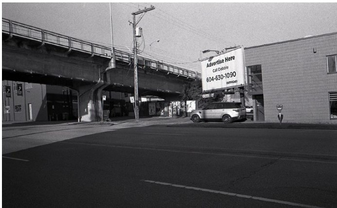
Nikon FM2n w/ Series E 50mm f1.8 lens