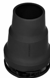
OCF II Snoot Reduce light spread and create crisp direct light. $139.00