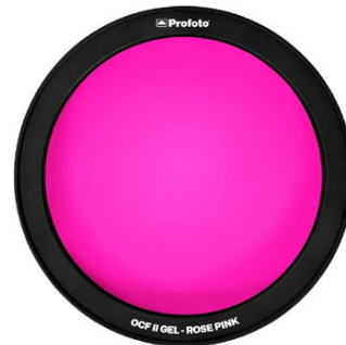
OCF II Gels Be creative with color. $99.00