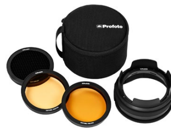
OCF II Grid & Gel Kit For color balance and creativity. $279.00

Get even more from your B10 and B10 plus with these new OCF II accessories: