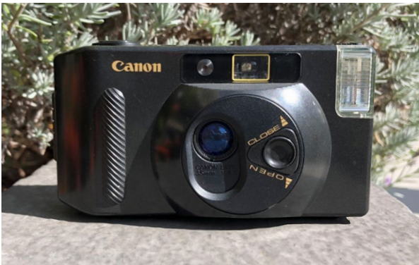
Canon Snappy S (Black) 1985 - $30.00 – A compact camera with a unique design. It has a 35mm f4.5 lens.