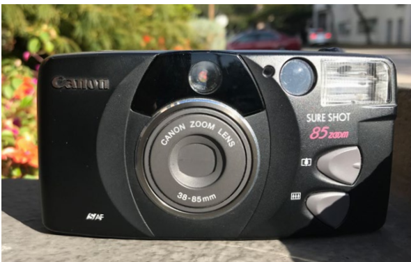
Canon SureShot 85 Zoom 1998 $90.00 - A compact camera with a 38-85mm lens. It uses a 123A battery, has a self timer, and flash controls.