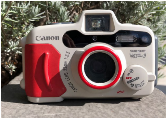
Canon SureShot WP-1 1994 - $175.00-150.00 – A compact auto focus 32mm f3.5 lens. This camera is a waterproof to 5 meters.