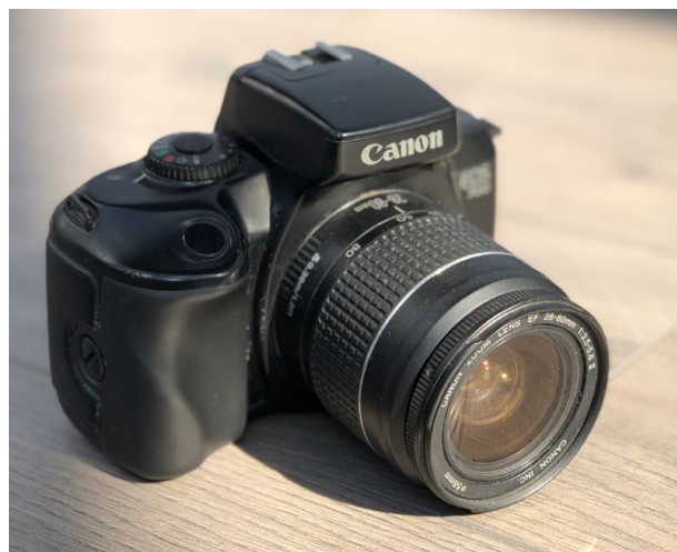
Canon EOS 700 w/ 28-80mm - $100