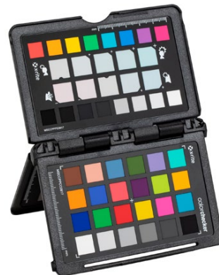
ColorChecker Passport Photo 2 - $159

I will be adding more to that post in the near future, with some sample images of various low and high CRI LED flashlights used as a light source in a small octagonal softbox. You'll be able to see the improvements that can