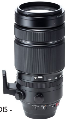
XF 100-400mm f/4.5-5.6R LM WR OIS - $1,950 (SAVE $500)