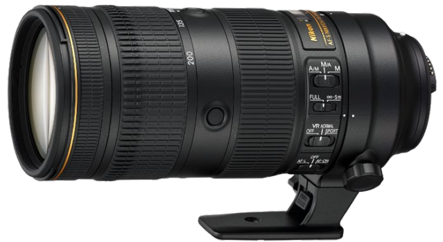
AF-S 70-200mm f/2.8E FL VR - $2,599 SAVE $1,000