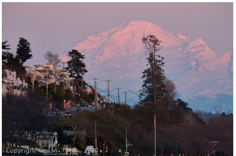
From White Rock beach, shot with Fujifilm X-Pro2, XF 100-400mm f/4.5-5.6 OIS @ 400mm, ISO 200, f/10 at 1/12 second on a tripod...