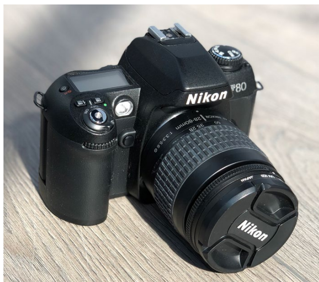
Nikon F80 w/ 28-80mm - 175.00

Have you been shooting digital for a long time but want to get on the film wave? Have you built a solid collection of AF lenses for your Canon or Nikon DSLR? Look no further than the Canon EOS film bodies from the late 80s and 90s as well as the Nikon F cameras of the same period. They take the same lenses, they have practically the same controls and if not for the part where you put film in in place of a screen and memory card, they look just like your DSLR too! Sure, they may not look very "retro" or "aesthetic", but they're the best that film cameras have to offer in terms of technology, and often times cheaper too. So grab that fancy Canon L glass or Nikkor telephoto and photograph someone from a safe physical distance!