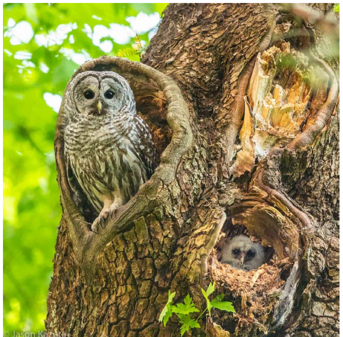
Momma Barred Owl with owlet - Nikon Z7 + Nikon 400mm f2.8G VR 1/40 sec, f2.8, 1600 ISO