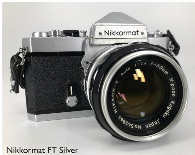
Nikkormat FT Silver

There are some great deals on Nikkormats right now: