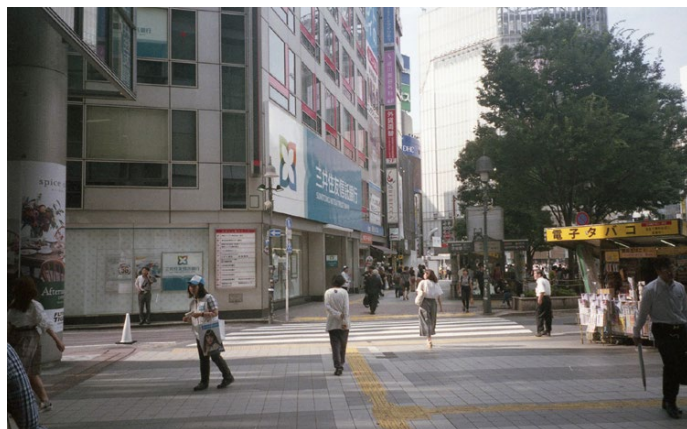
Fuji Superia 400 - on a Contax TVS - Brandon Leung