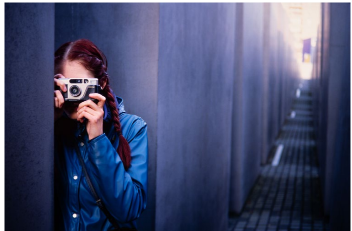
Berlin, Germany. Kodak Ektachrome 100 film.