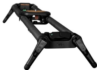
SYRP MAGIC CARPET MEDIUM SLIDER SYKIT-0017H $484.95