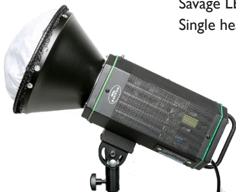
Savage LED 100W Single head light kit.

We are now able to offer the Savage LED 100W single head kit with an 8ft stand.