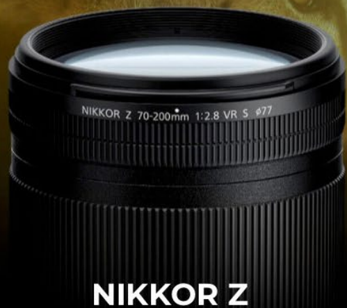
NIKKOR Z 70-200MM F/2.8 VR S