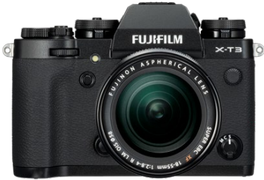
X-T3 Kit w/18-55mm - $2,199 (SAVE $200 + FREEVG-XT3*)

Now there's a compelling sale to get you into a medium format GFX body and a compact (near 'pancake') lens! Also below is another great deal: get a FREE vertical battery grip with an X-T3, after MAIL-IN OFFER.