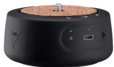
GENIE MINI II SY0033-0001 $364.95

for some great videos to educate and yes, inspire you. Here is a taste of what Syrp offers and their prices.