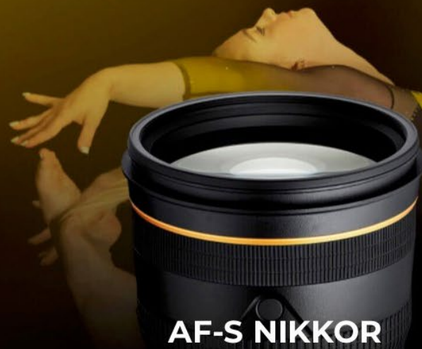
AF-S NIKKOR 120-300MM F/2.8E FL ED SR VR