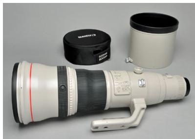
Canon EF 800mm f/5.6 L IS USM Now $9000.00! Was $12000.00 Like new condition