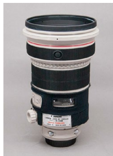
Canon EF 200mm f/2 L IS USM