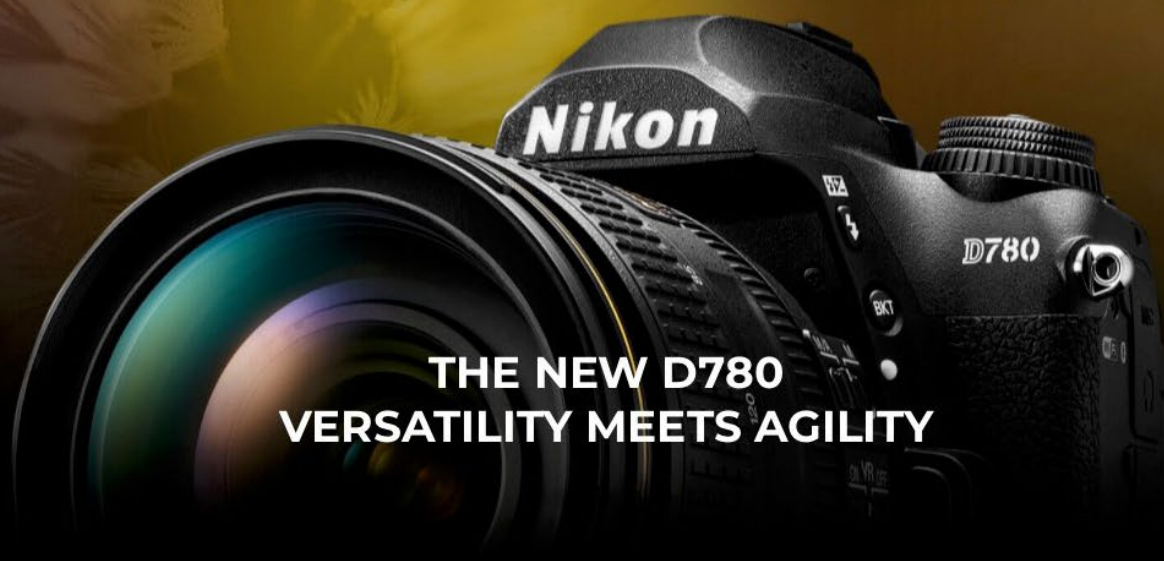
THE NEW D780 VERSATILITY MEETS AGILITY