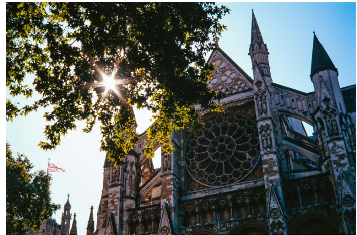
Westminster Abbey, London, England. Fujifilm Provia 100 film

Check out our blog post for more details, and information and my experience using the 167MT as well as some Contax history! https://www.beauphoto.com/on-holiday-with-the-contax-167mt/