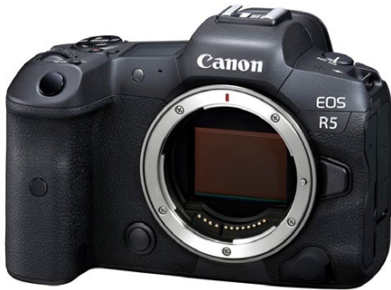
Canon R5 - a mirrorless camera