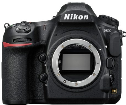
Nikon D850 - a DSLR camera

A question I have been asked a lot recently by customers who are either significantly upgrading their system, or getting into a new interchangeable lens camera system, is whether or not I would recommend a digital single-lens-reflex (DSLR) or a mirrorless camera. Each system has pros and cons, and I am going to try and explain those here, mostly in point form, but some points I will elaborate on a little more. For ease of writing, I've decided to use the abbreviation ILC (interchangeable lens camera) to refer to mirrorless interchangeable lens cameras in general. Note that every major manufacturer we deal with at Beau Photo, be it Canon, Fujifilm, Hasselblad, Nikon, or Sony, are all now offer very compelling ILC bodies that are generally up to the task of fulfilling the demanding needs of professionals