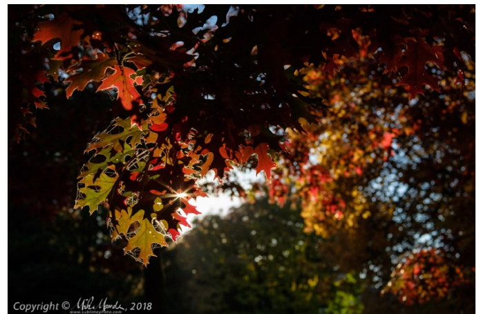
Fujifilm X-Pro2 body, 50mm f2 RWR lens

You could print your best fall colour image yourself! Here is one from Mike for inspiration.