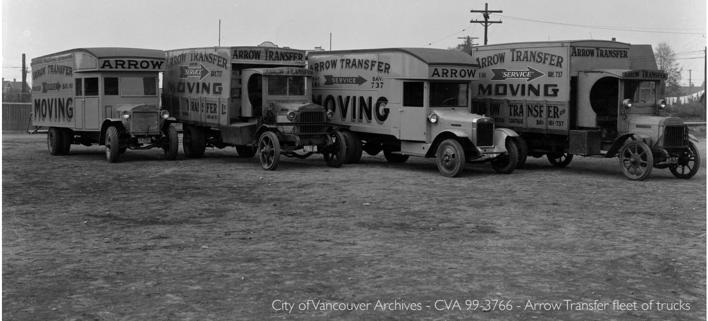
City of Vancouver Archives - CVA 99-3766 - Arrow Transfer fleet of trucks

We are excited to announce that the rumours are true: Beau Photo will be on the move in late 2018! This is something that's been in the works for well over a year, and the plan is now coming together. We are in the process of securing a new location and once everything is finalized, we'll let you know. With even more developments scheduled in the area of our current location, the time is ripe for us to head elsewhere and we're sure you won't miss the parking struggle! Once we have finalized the where and when, you'll want to "Save the Date" for the big Welcome to our New Store Party we have planned!