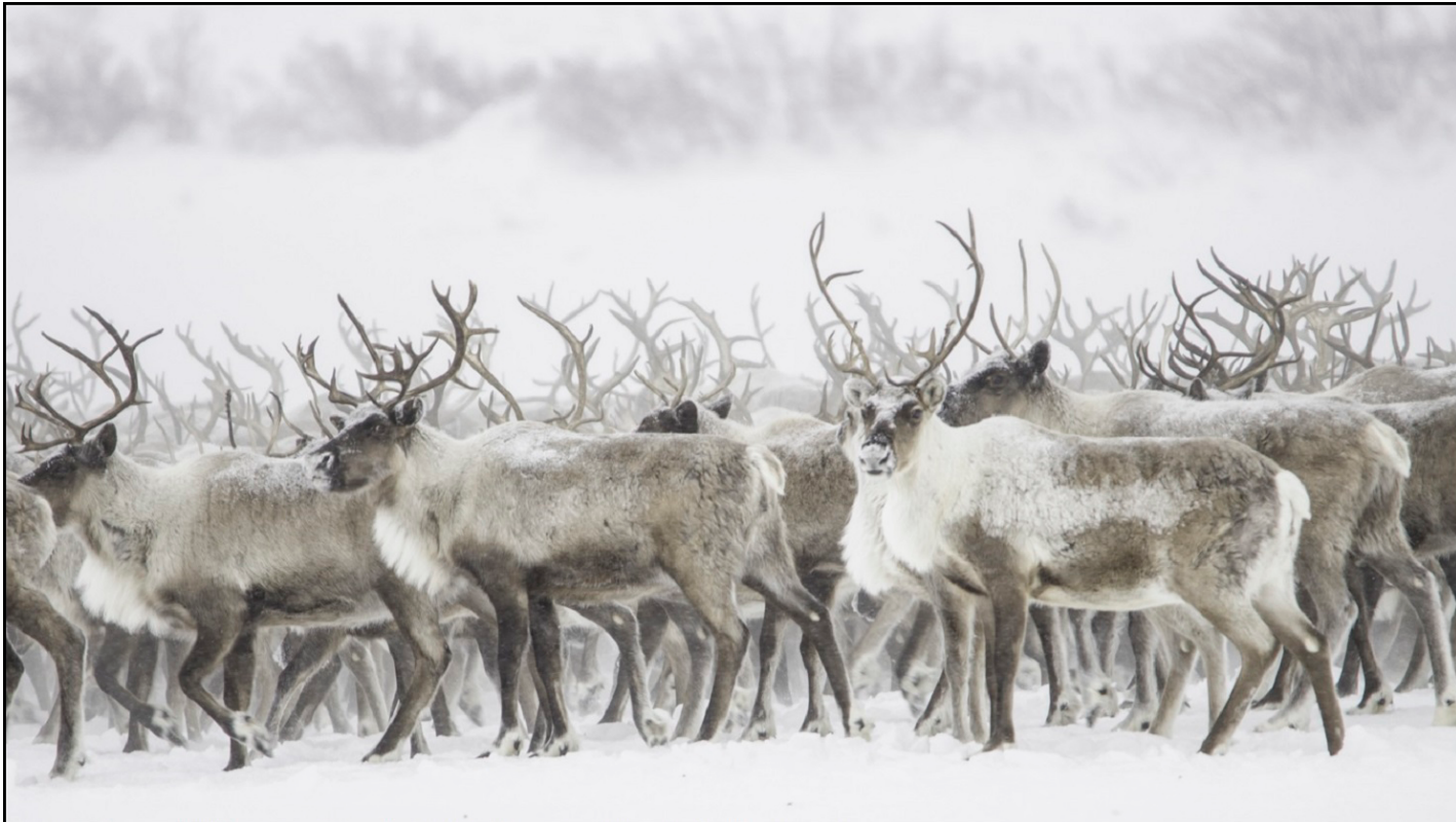
Sylke Baranski "Moving along" - 2017 Silver Medalist, Individual Entries