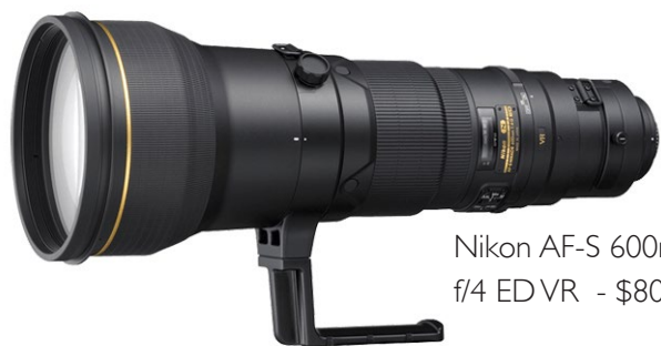
Nikon AF-S 600mm f/4 ED VR - $8000.00

Our used equipment section on our website is growing every week so don't forget to check it out on a regular basis as well look for the great deals you can find in our clearance section.