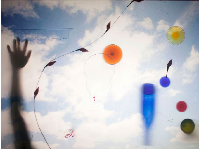
Nadia Belerique, In The Belly Of A Cat, 2018 BC Hydro Dal Grauer Substation Public Art Project

April in Vancouver means that it is time for the Capture Festival! Photography exhibitions are taking place all across the city, and there is such a variety of work on display that you will find something that interests you. There are also photography themed programs on the Knowledge network in April