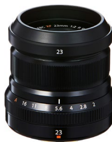
Fujifilm 23mm f/2

of the time, you'd likely never notice. Of course if you are shooting wide open, then the f/1.4 give you an advantage with respect to background blur, but how important is that really for a wide angle lens, and if anything, the bokeh might even be a bit smoother on the f/2. I personally own both of those lenses and find myself almost always using the less expensive 23mm f/2!