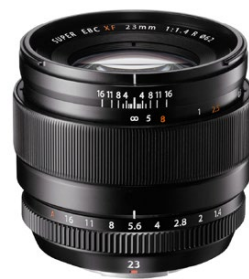
Fujifilm 23mm f/1.4

Without going into lots of detail on all the various comparisons, let me say that quite often, the less expensive and slower lens might actually have superior optics since it is always easier to optimize the optical design of a slower f-stop lens for any given focal length and sensor size, compared to a faster f-stop lens. It may be easier to minimize distortion and flare and achieve superior resolution across the frame compared to a faster f-stop lens. The one thing you might give up with cheaper lenses is build quality though. For example, in the case of the Nikkor AF-S 85mm f/1.8G, while is absolutely superb optically in every way, when you pick it up next to its pricier f/1.4G brother, you will immediately notice how much more solid the more expensive lens feels. However in the case of the Fujifilm comparison, I'd say that if anything, the little f/2 lens feels even better made than the more expensive f/1.4 version, so build-quality doesn't always suffer, even on cheaper lenses.