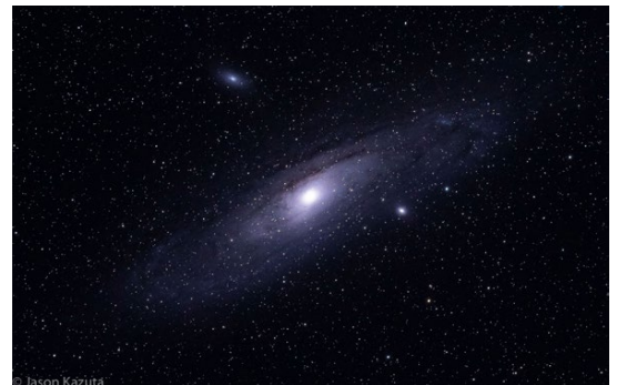
Image of the Andromeda Galaxy taken with Sony A7RII + Canon 400mm f5.6L, 7 minute exposure.

reframe your image without disrupting the cameras position is also included. $35/day