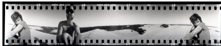
Lomo Spinner 35mm

A month back my partner and I travelled south to Burning Man. We planned to nip straight down to Nevada then meander our way to the Oregon coast travelling north towards Vancouver. After much thought, I narrowed my film camera choices to three: my Polaroid 600 , my Polaroid Land 195 and my Lomo Spinner 35mm camera, which I had intended to shoot with last year and didn't, so I was determined to this year! I also brought my digital, a Fujifilm X-E2 with a 35mm lens. When choosing these cameras I had to consider if they'd survive the intense Black Rock Desert dust.