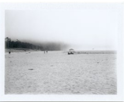
Cape Lookout with the Polaroid Land 195

After leaving the Black Rock Desert we found out it had been a windy week all over the west. We drove across to Florence Oregon and the sand dunes where I managed to get up early before the wind to take some photos! I find blowing sand more intrusive than playa dust so I only used my 600 and Spinner on the Dunes, I didn't dare bring the digital.