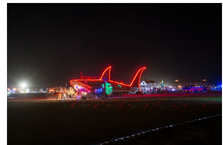
A night shot with my X-E2 and the 35mm lens.