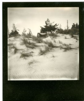
Florence, Oregon with the Polaroid 600

After leaving the Black Rock Desert we found out it had been a windy week all over the west. We drove across to Florence Oregon and the sand dunes where I managed to get up early before the wind to take some photos! I find blowing sand more intrusive than playa dust so I only used my 600 and Spinner on the Dunes, I didn't dare bring the digital.