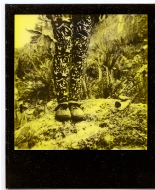
Impossible Third Man Records

We have both of these in stock right now for $35.65 per pack.