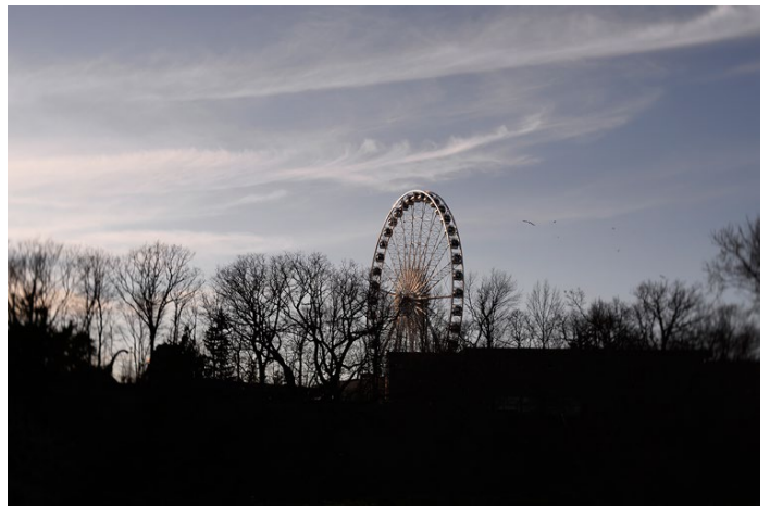
images ©Kathy Kinakin Taken with the new Lensbaby Velvet 56 lens stopped down to f1.6 for full sharpness.