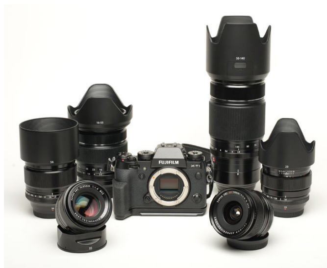
The Fujifilm Collection in Rentals

Fujifilm Fujinon XF 14mm f2.8R $30/day Fujifilm Fujinon XF 23mm f1.4R $30/day Fujifilm Fujinon XF 35mm f1.4R $25/day Fujifilm Fujinon XF 56mm f1.2R $30/day Fujifilm Fujinon XF 10-24mm f4R OIS $30/day Fujifilm Fujinon XF 16-55mm f2.8R LM WR $35/day Fujifilm Fujinon XF 50-140mm f2.8R LM OIS WR $35/day