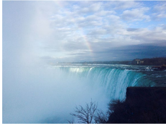
Niagara Falls