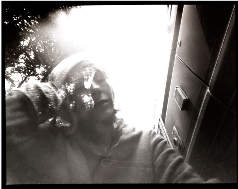
Attempted Self Portrait ©Nicole Langdon-Davies

Sunday April 26th was Worldwide Pinhole Photography Day . People around the world got out with their pinhole cameras and took photos. Here at Beau, two of us participated, using very different mediums. Here are the results! You can see the Pinhole Day gallery at http://pinholeday.org