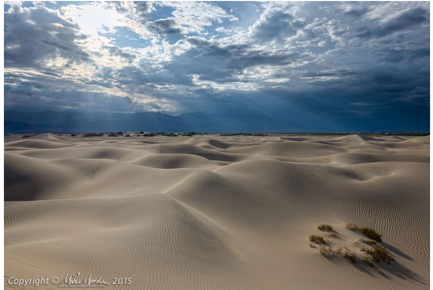
Fujifilm XF 16mm f/1.4 R WR Lens - X-E2 body

Fujifilm has introduced a new, fast wide-angle 16mm prime lens, equivalent to a 24mm in full-frame terms.