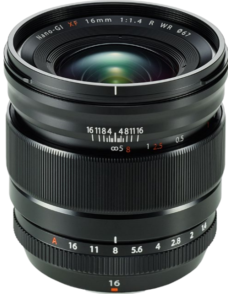
Fujifilm XF 16mm f/1.4 R WR Lens