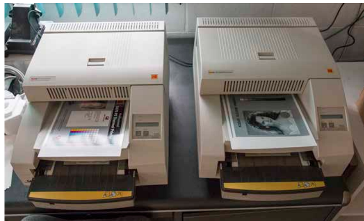
Kodak Dye Sublimation printers.