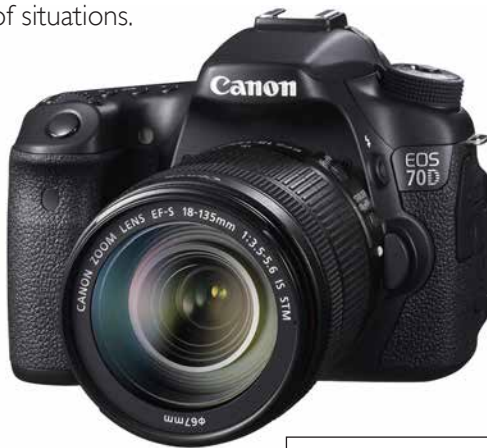
New! Canon EOS-70D ($1,299 body or $1,649 kit with EF-S 18-135mm STM)