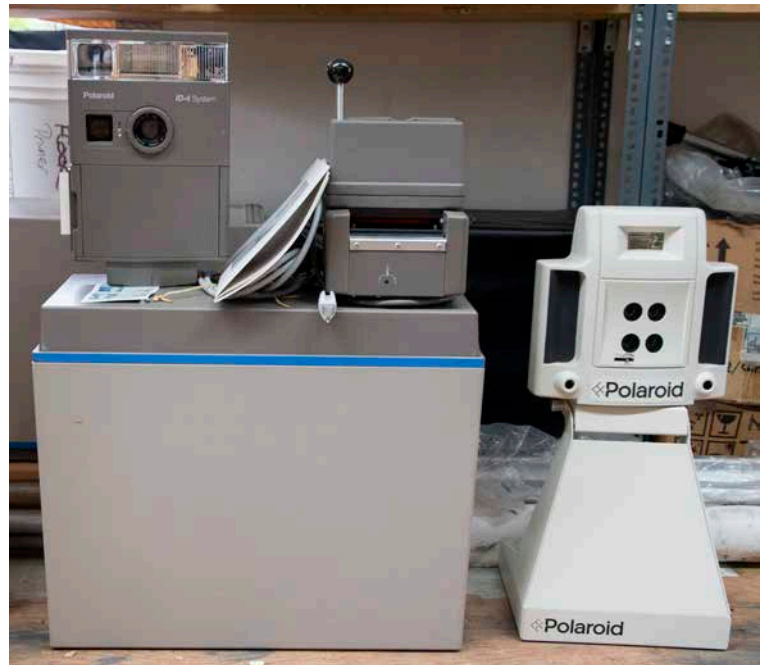
Weird Polaroid cameras.

And much more including cameras, lenses, lighting... See you there!