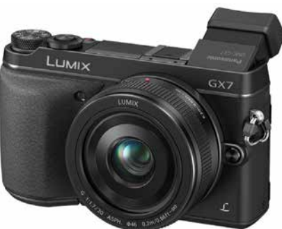
Panasonic GX7 - $1,099 body

The Panasonic GX7 is a new high-end, compact Micro-4/3 body from Panasonic, available in black or in a more retro-styled two-tone silver and black. It is a substantial upgrade from the similarly sized GX1 in that not only does it have a rear capacitive touchscreen LCD that can pivot up or down, but it also has a built-in EVF that is offset "rangefinder style", similar to the Fujifilm X-E1 and doesn't create a big viewfinder hump on top. This integrated EVF can also pivot up 90 degrees and in the above photo of the black body, you can see it up at about a 45 degree angle.