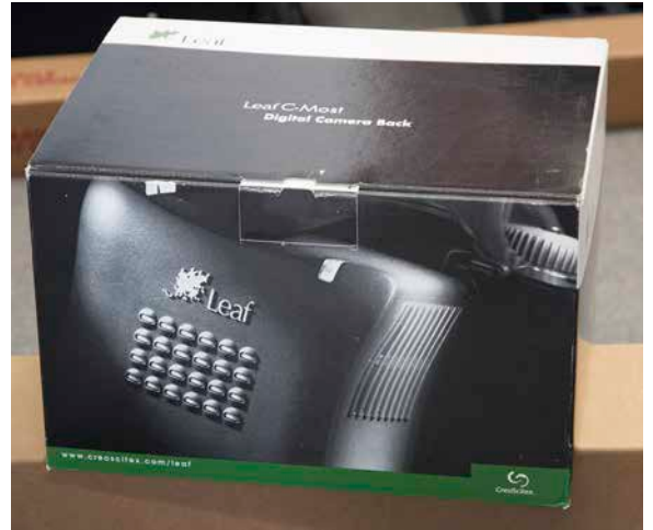
Leaf Digital back for Hasselblad 500 series cameras.