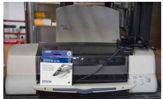
Epson 1270 printer.