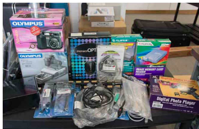
Cool old digital stuff.