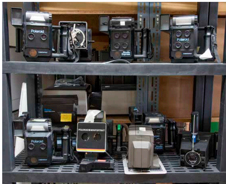
An assortment of Polaroid cameras.