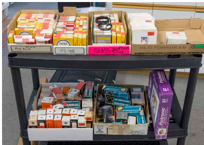
Bulbs, step rings, filters...