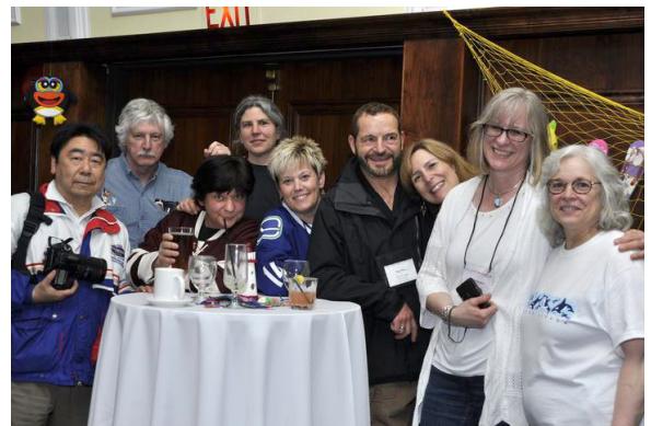
Fun at the fun night!