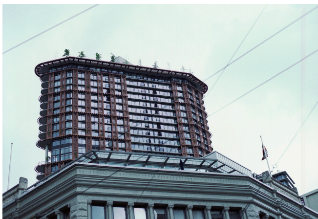
Fuji Velvia 50.