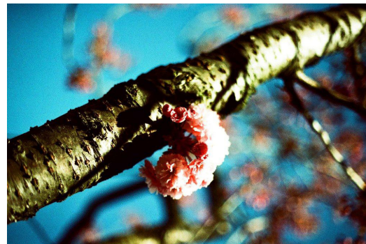
Fuji Provia 100f.

When you've finished shooting the roll, then it becomes time to cross process it. I suggest that you leave the first few rolls