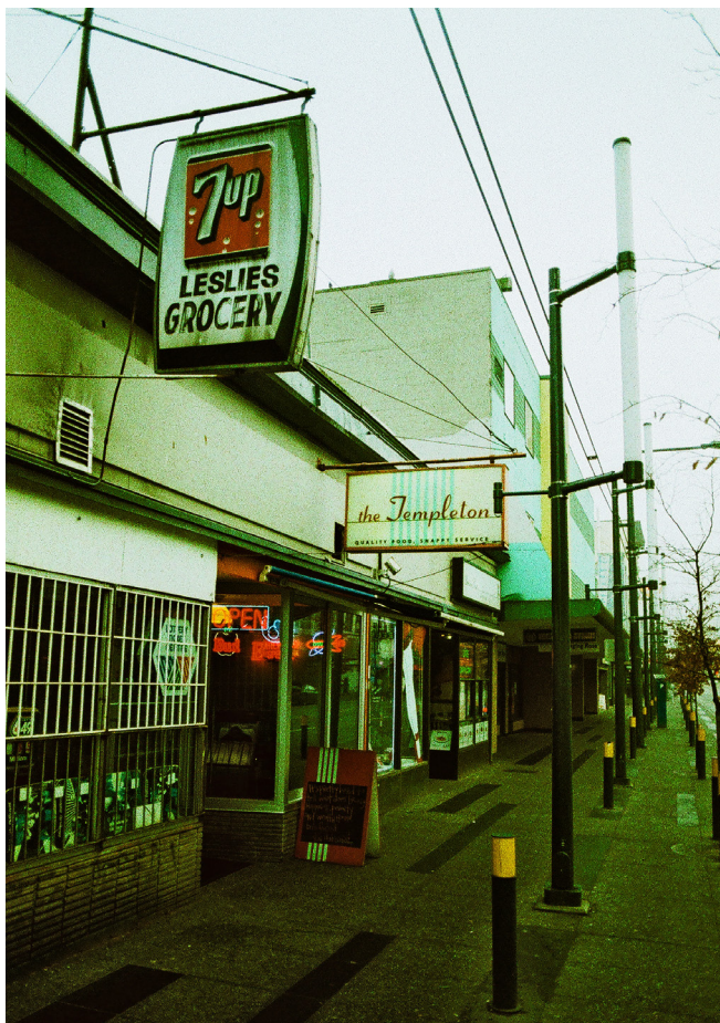
Rollei CR200pro.