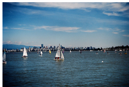
Fuji Provia 100f Taken on a sunny summer day.