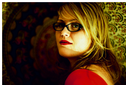
Fuji Provia 100f Taken indoors with a tungsten spotlight.