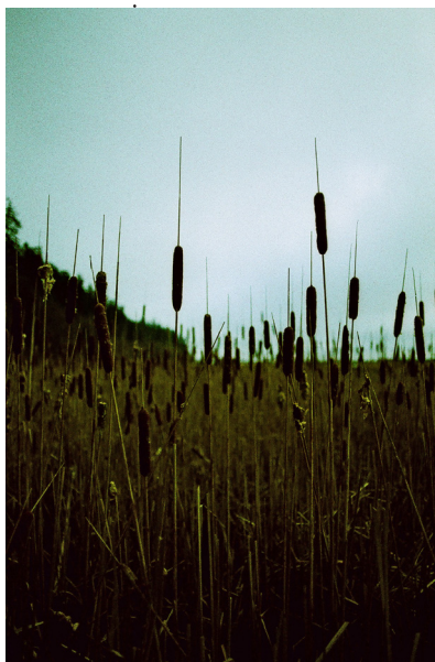
Rollei CR200pro.

C-41 negative to E6 slide cross processing is also possible, though it results in a completely different type of effect. It can also be a little more challenging to get the correct exposure so prepare to do some testing. Watch for a writeup on this process in an upcoming newsletter.