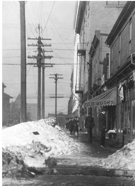
Str P94 - [Snow piled on the sidewalk between Seymour Street and Richards Street] William Stark [between 1914 and 1918]