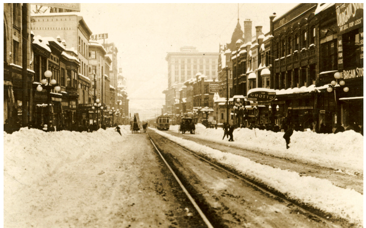
CVA 371-1118 - [Looking north from Georgia Street at a snow-covered Granville Street] William Stark 1916