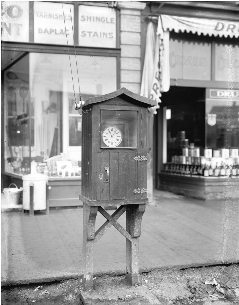
City of Vancouver Archives LGN 1189.1 - [Time clock used by motorman to report to Control Office from the end of a remote streetcar line] William Stark [191?]

Beginning in January, we will be open until 7pm every Thursday!