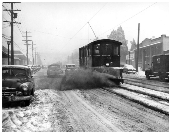
2009-005.517 - Sweeper car brushing away snow [193-]