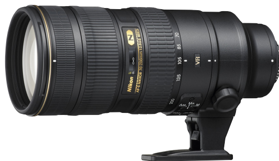
AF-S 70-200mm f/2.8G IF ED VR II

We now have the Nikon AF-S 70-200 f4 G VR in stock and in rentals. Try before you buy - rent it and if you decide to buy one, we will credit up to two days of the rental toward your purchase.