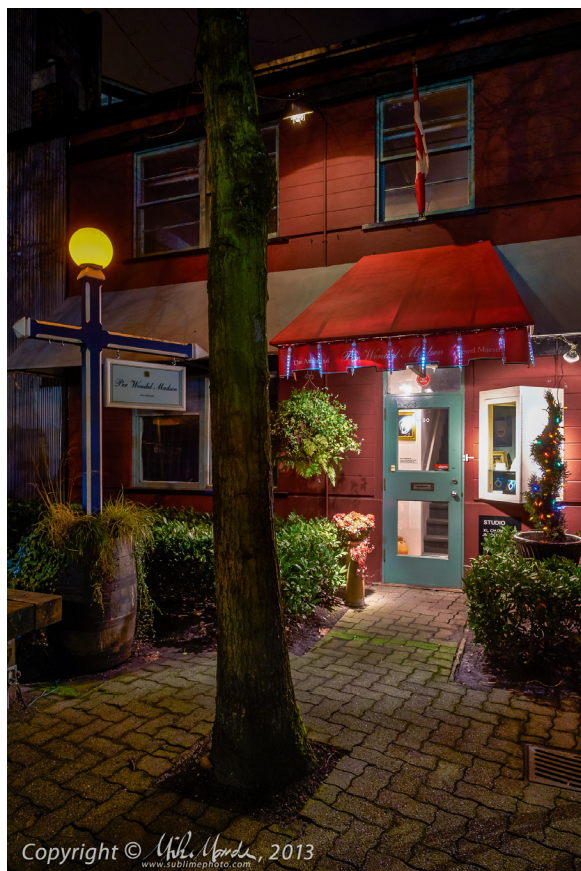
Fujifilm X-E1 body with the new XF 14mm f/2.8R lens

Come in to Beau Photo to see some 24x36 inch sample prints from this exceptional new lens. The XF 14mm f/2.8 R has exceeded my expectations and is one of the best lenses for Fujifilm's X system. Our first shipment is sold out but we are expecting more very soon. The price is $899.