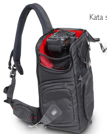
Kata sling bag.

Please call or email info@beauphoto.com for more information