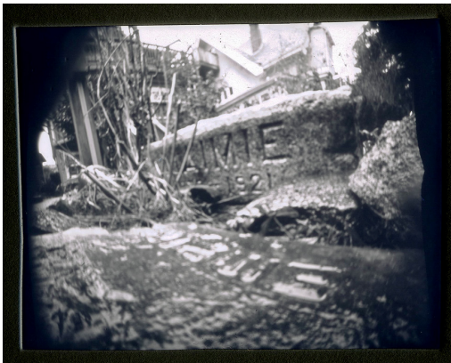
K. Kinakin, 2013

In a world that has turned almost completely digital, pinhole cameras are a step back into the world of analogue. It can be as simple as creating cameras from found objects, or as complex as making a camera from scratch. Either way, you are the creator of both the camera and the image.