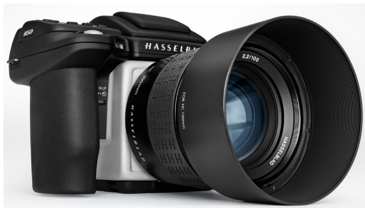
The new Hasselblad H5D with 100mm f 2.2 lens