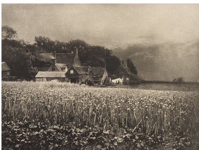
"The Onion Field" George Davison Photogravure, 1890 (From The National Gallery of Australia )

The basic principles of pinhole optics were known as early as the 5th century BC when it was observed that light shining through very small openings would project an image of what was outside. Since then, pinholes have been used in telescopes, reading glasses, cameras and other optical instruments. In photography, the pinhole camera became popular when George Davison exhibited a pinhole photograph at the Royal Photographic Society exhibition in 1890. Pinhole cameras were commercially produced for a short time but fell out of favour in the early 1900s.