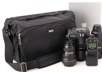
Think Tank shoulder bag