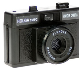
The Holga 35mm pinhole camera

Pinhole cameras can be built from almost anything, as long as the object can be altered so that it doesn't let light in from anywhere but its pinhole. Though in a pinch, a ready-made pinhole camera, such as a Holga 120WPC, could be used, or the body cap from a regular SLR film or digital camera body can be modified into a pinhole. Too busy? We stock already-made pinhole caps for Nikon & Canon cameras. Won't fit your camera? Don't despair, caps for other camera models can be ordered in.