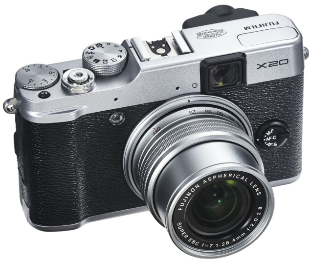
The new Fujifilm X20 - $649