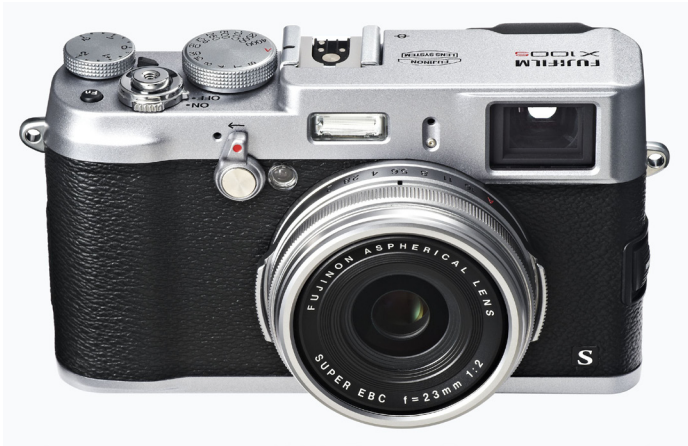
The new Fujifilm X100s - $1299

These cameras are slated to start shipping in March, so if you want to get in on the first shipment, call (604-734-7771) or email ( digital@beauphoto.com ) to place your pre-order ASAP!