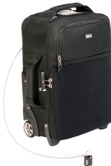
Think Tank roller