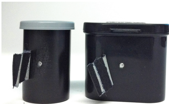
Film canister pinhole cameras