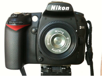
Body cap for a Nikon camera

A quick search online will find pinhole cameras that have been made from everything from washing machines and vans to red peppers and lego. To make your first camera, use a fancy tin or box of any shape, or try something more unexpected like a pumpkin, teddy bear or a Polaroid back. Many of the things needed to build a pinhole camera can be found around the house, including the object you will be transforming into a camera and the material you make your pinhole from. The rest of the items, black gaffer tape for sealing off light leaks and the light sensitive material used for capturing your image can be picked up here at Beau.