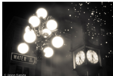
Image produced using a pinhole body cap on a Canon digital camera.

flickr For more pinhole camera images, check out the Beau Photo Flickr page at flickr.com/photos/beauphotostore