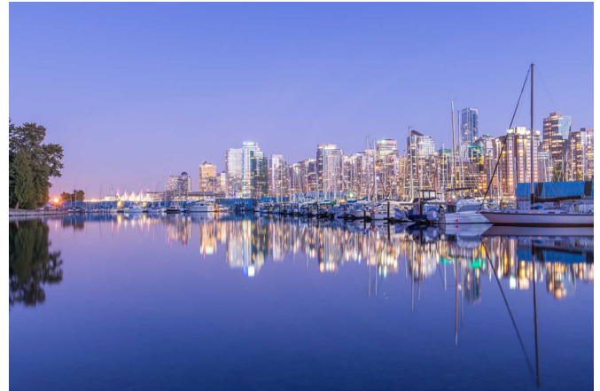
30 seconds, f8, 200 ISO @ 35mm with D600 body and 24-70mm f2.8G lens