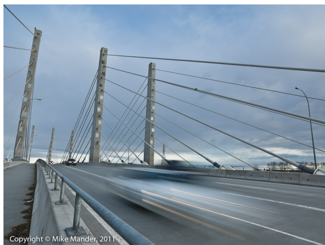
Taken with the Hasselblad H4D-60 and a 35mm lens