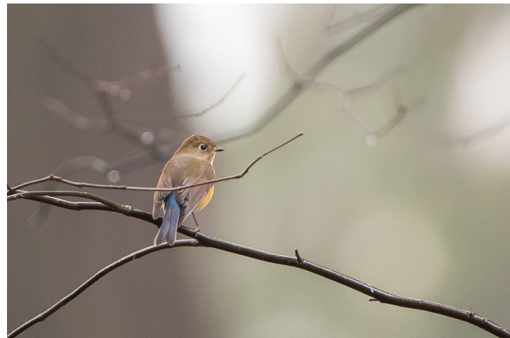
Red Flanked Bluetail

*** Please note that a security deposit is required at the time of pick up.