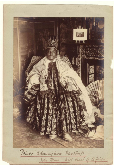
Francis W. Joaue, West African King, c 1890, Albumen print, 16.5 x 22cm

Collected Shadows: Photographs from the Archive of Modern Conflict