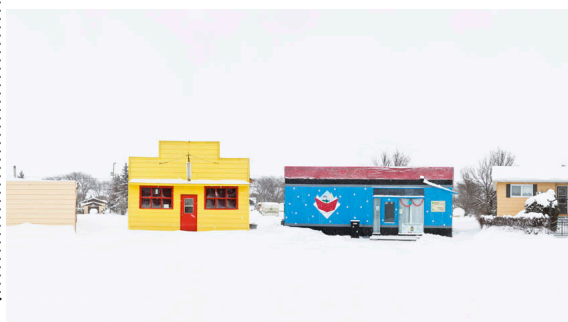
05/10/2013 to 26/10/2013 Main Street, Danny Singer: Gallery Jones