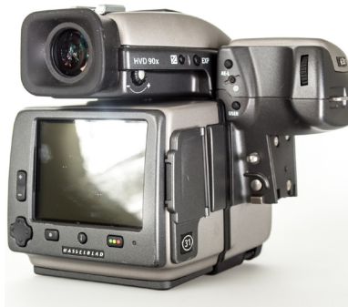
H3DII-3I, no lens - $5500