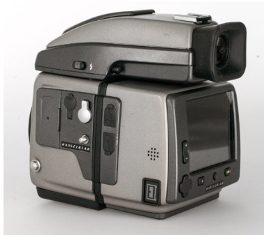
H3DII-3I, no lens - $5900