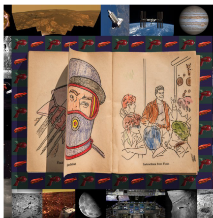
06/09/2013 to 12/10/2013 Out of Fiction, Jim Breukelman Republic Gallery

For more information, visit their website at - http://capturephotofest.com