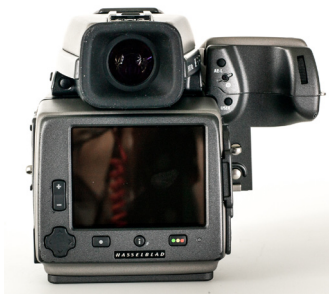
H3DII-50, no lens - $9800