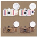
Lomography La Sardina Cameras

Check out our price guides and web guides if you need some info.