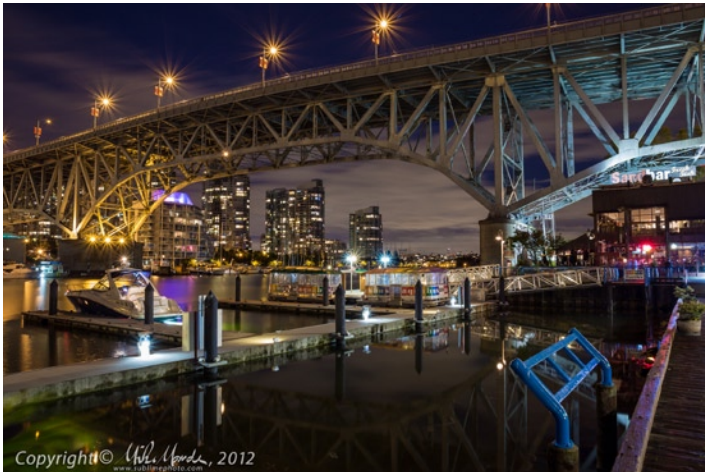
Time exposure test shot with the EOS-5D Mark III using the new EF 24mm f/2.8 IS at ISO 100, f/13 and 120 seconds.

Personally, I have not yet tested the new 28mm, but both of these two new lenses are in rentals already. Jason here has tested the 28mm and has declared it optically superb as well. Both lenses look and feel very well made, although they are not 'L' grade construction and thus are not weather-sealed. Also, not being 'L' lenses means that Canon does not include lens hoods either. The optional bayonet mount hoods are just under $60 and as far as the lenses themselves, the new 24mm is $929 and the 28mm is $885. No, not inexpensive, but optically they are absolutely top-notch and worth the money.