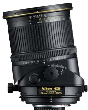
PC-E 24MM F3.5 D ED