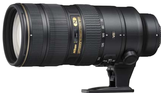
AF-S 70-200mm f/2.8G IF ED VR II

We now have the Nikon AF-S 70-200 f4 G VR in stock and in rentals. Try before you buy - rent it and if you decide to buy one, we will credit up to two days of the rental toward your purchase.