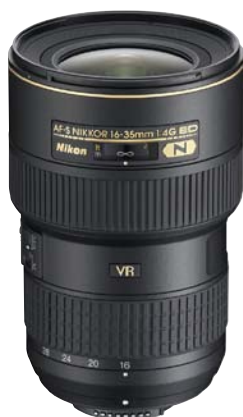
AF-S 16-35 mm f/4G VR