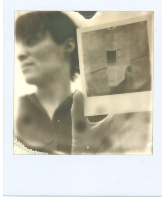
photographs by impossible testlab

Beau Photo is excited to have in store the much anticipated new instant film by The Impossible Project in Austria! This first flush monochrome film is available in 100 and 600 formats for use in the Polaroid SX-70 and 600 cameras. The PX 100 & 600 films render an astonishing pastel Sepia tone, combined with a highly sensitive overall exposure performance and sensitivity to processing temperature, to produce fresh characteristics and results. For those who are keen to try out the new films we would recommend following the specific instructions provided by the Impossible team. Our staff here at the store have shot with both films, and find that it is best to keep the film from light as it discharges from the camera, and avoid physical contact with the surface of the film as it is being processed. The resulting images are pleasing despite the occasional unexpected outcomes. We look forward to the color film from the Impossible team which is expected as soon as this summer and for now we are happy to have the first flush film. Come and check it out!