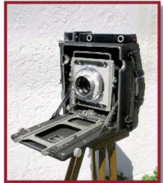
"Tons "o" Hasselblad" come in to view.